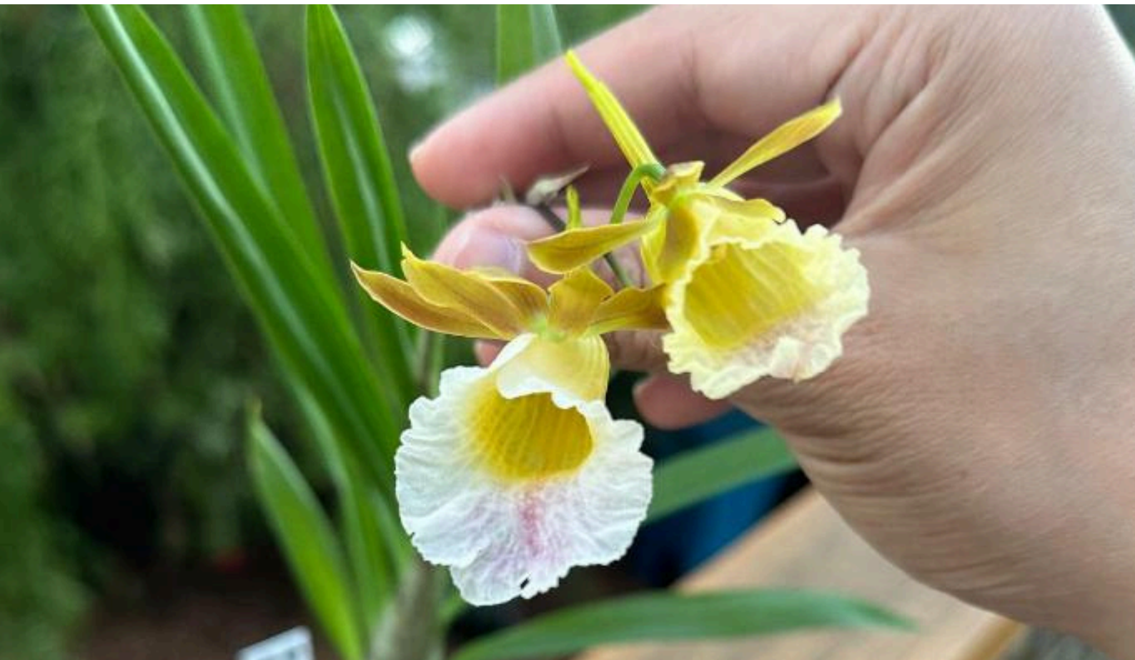
Top: Laeliocattleya Irene's Song "Montclair" HCC / AOS (Dan Colton)