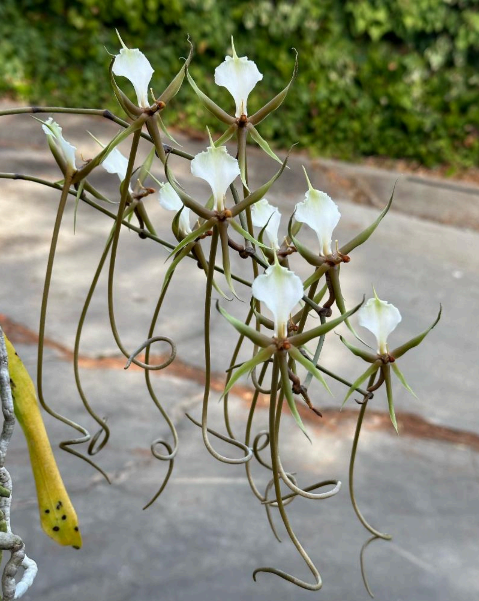
Plectrelminthus caudatus (Yufei Cheng)