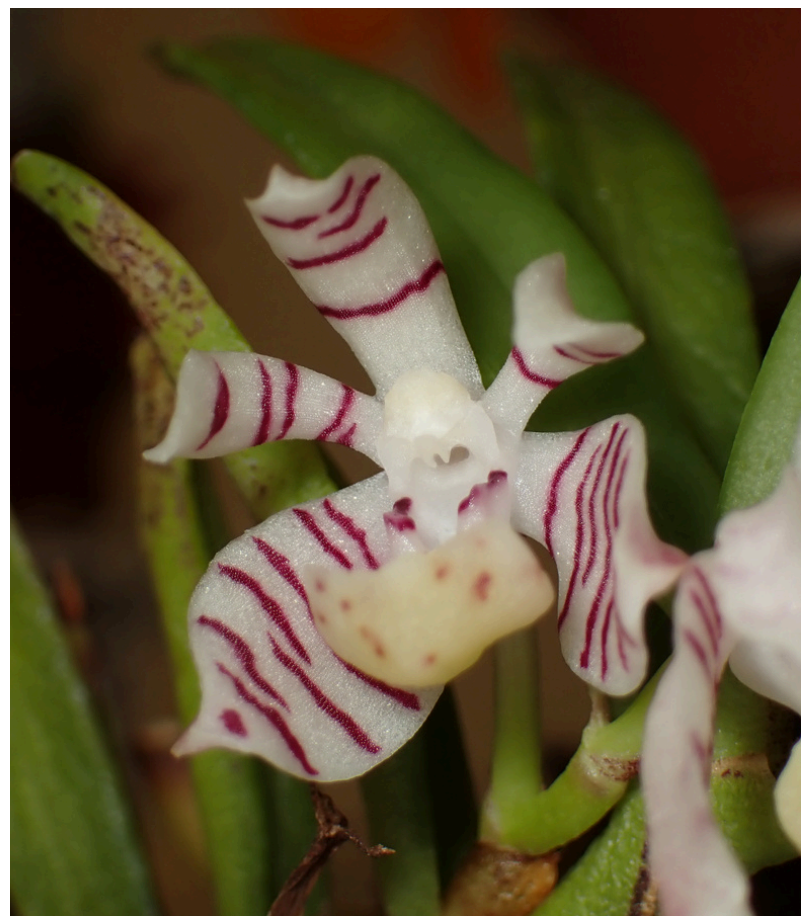
Clockwise from top left: Dendrobium trantuanii, Vanda falcata 'Shutenou', Trichoglottis pusila, and Phalaenopsis equestris