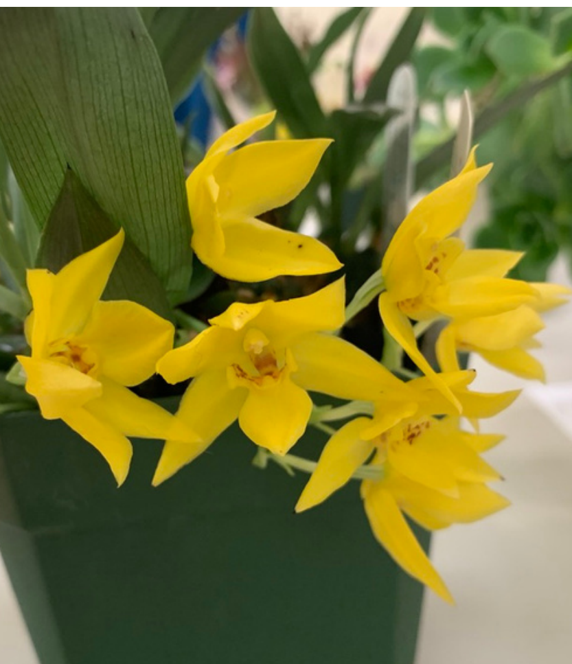
Clockwise from top left: Cypripedium pubescens (Leo Kusber), Strongylaria pannea (Chaunie Langland), and Promenaea silvana 'Zorro' CCM/AOS (Chaunie Langland)