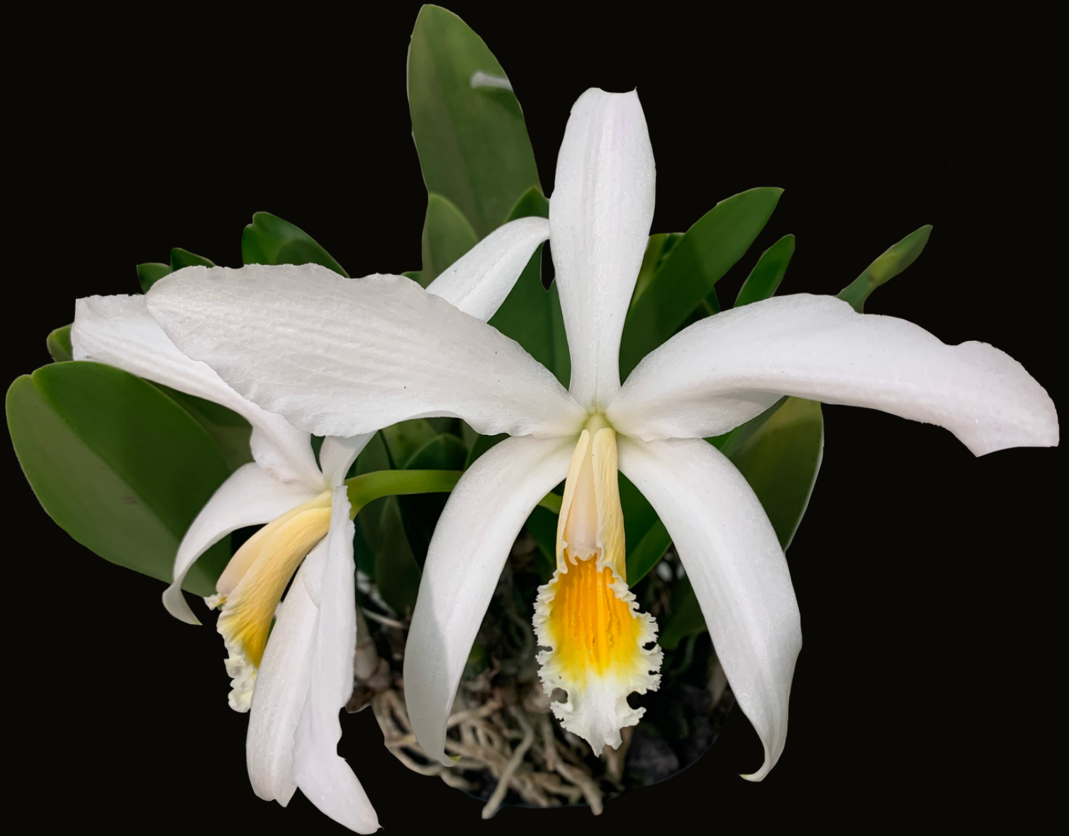
Laelia jongheana alba 'Egret' grown by Anthony Rivera