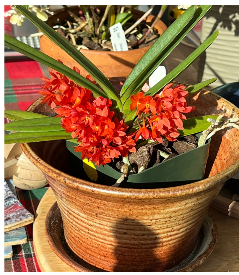
Clockwise from top left: Caulocattleya Chantilly Lace 'Twinkle', Sedirea Japonica Nagoran, Ascocentrum miniatum , and Maxillaria tenuifolia (all grown by Viktoriia Kolotovska)