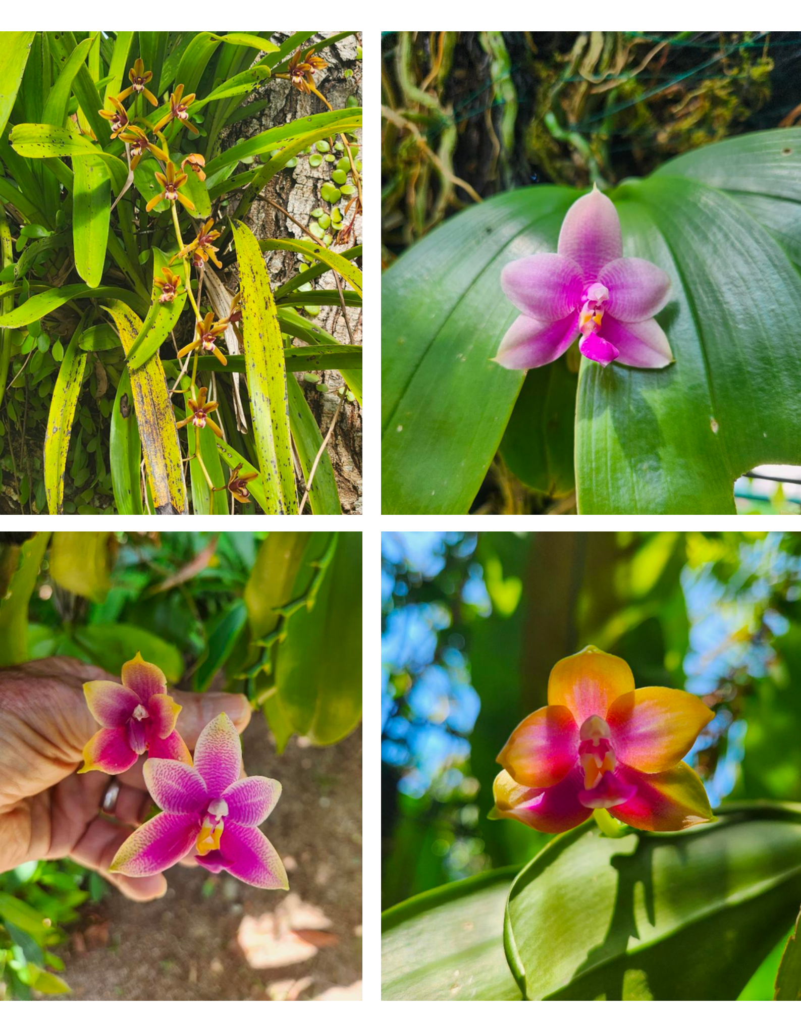
Clockwise from top left: Cymbidium aloifolium in Pasir Ris Park, Singapore (picture taken by Tom Waugh) and three NOID Phalaenopsis hybrids in Tom Waugh's daughter's garden in Singapore