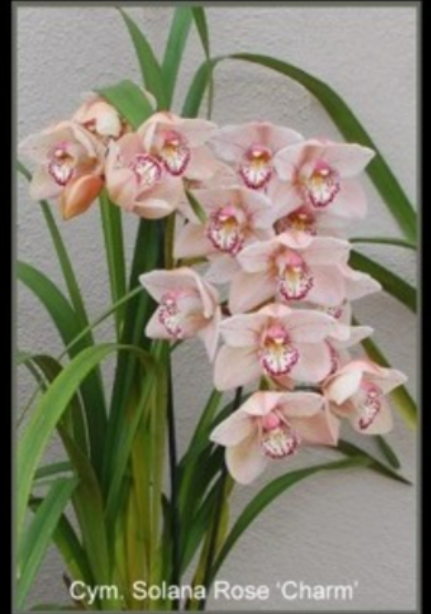
Cym. Solana Rose 'Charm'

Community Activities Building 1400 Roosevelt Ave, Redwood City, CA