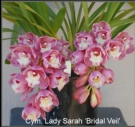
Cym. Lady Sarah 'Bridal Veil'