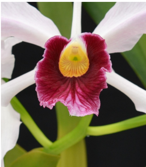
This is a good vini lip, and close to a very dark red.

If we go further in the red direction, we lose most of the pink tones and all the salmon ones, and end up with a vinicolored lip, a relatively rare color in purpuratas .