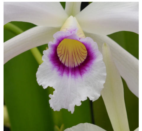
An even wider ring.