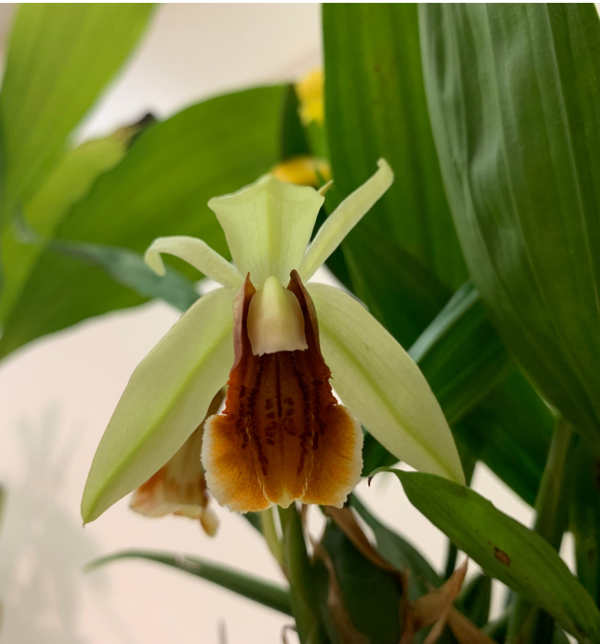
Coelogyne tommii, grown by Roey Shaviv

You may also prepare your own slide presentation - perhaps even stage a show-type display, photograph it and talk about your various plants.