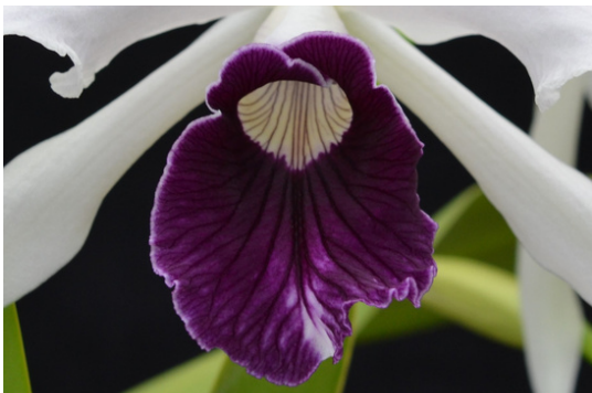
A third roxo-violeta lip.