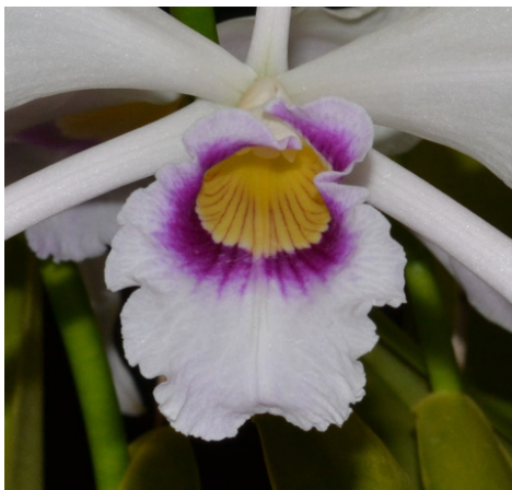
The widest ringed form I have. This is sometimes called the argalao form.