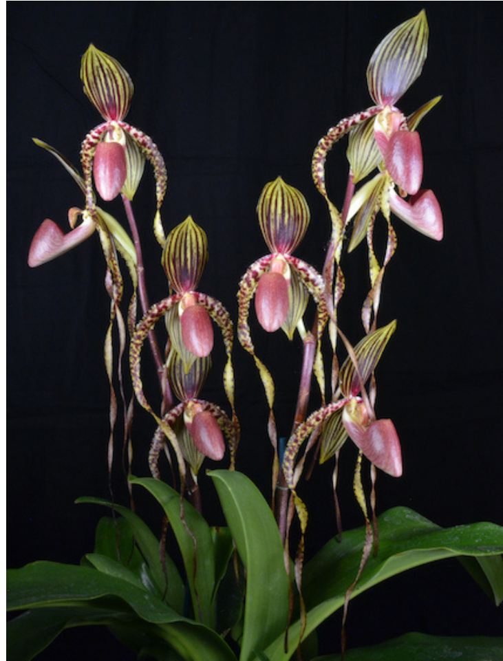
Paphiopedilum Dale's Dragon 'Austin Creek' AM/AOS