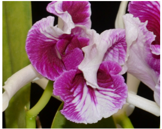
Sometimes there are actually three lips, and no petals. This is rare, but can occur in almost any lip color.

Some lips are classified by the placement of the color on the lip, rather than just the lip color. The annelata form, or ring form, has a full ring of color on the outer throat of the lip, but no color on the main portion of the lip.