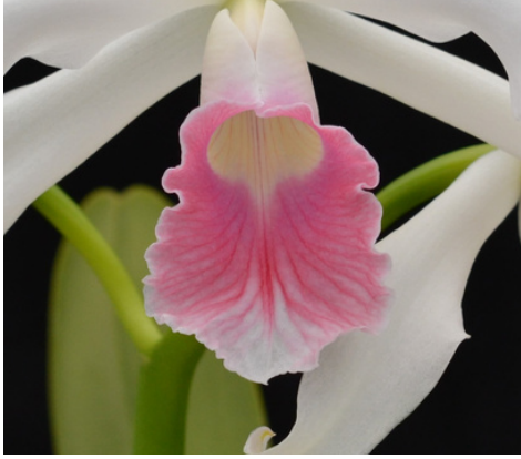
Back to a fairly typical carnea lip.