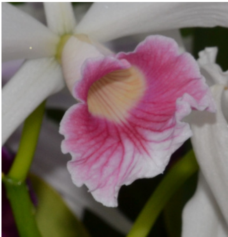
This is a relatively typical carnea lip.

A highly desirable but relatively available lip color is the carnea, originally thought of as being flesh colored, lip. This comes in a wide variety of colors from vary pale to vary strong, with some now verging on a truly red lip. These tend to be on white flowers, so they are actually semi-albas.