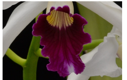
If the flower is white, and the lip is a solid dark purple with no white notch at the tip, the flower is considered an atro-violacea , or just atro , color. This particular flower changes from year to year, sometime having the white notch, and sometimes not. This photo shows a small white notch, so this year it was almost an atro .