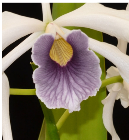
The color can be slightly lighter and still be considered Werkhauseri. Note that the notch is less pronounced on this lip.