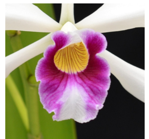
Sometimes a lip will be occlusa one year, and not the next. This year, this one didn't quite make it.