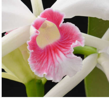
A slightly darker carnea lip.