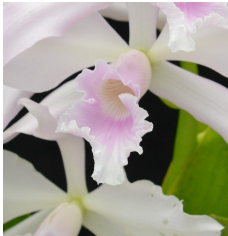
Lighter colored carnea lips are often referred to as russelliana, as shown here.