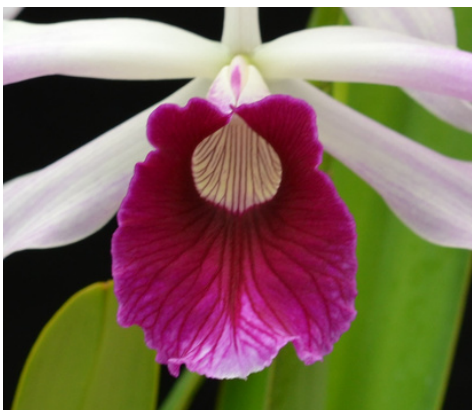
This example clearly shows the lighter colored portion of the lip.

Starting again with the type, or tipo, form of purpurata the lip color tends to be a dark lavender to rose-purple, usually having a lighter colored to white notch at the bottom of the lip. There can be many different names for this color lip, depending on the region of Brazil designating the color, or even the individual grower – a small distinction in color merits a different name among some purpurata fanciers.