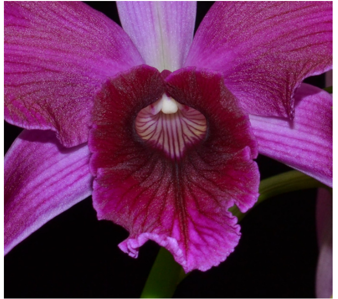
The sanguinea lip color tends to be a fully saturated pinkish purple. There's a little yellow color in the throat, but the darker coloration of the lip makes it less obvious.