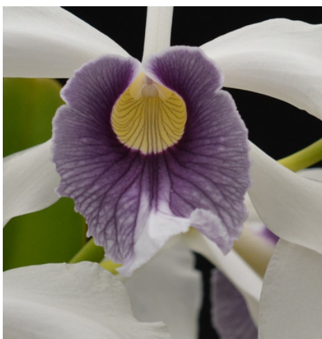
Sometimes they can have a large white notch at the center of the lip, as shown here.

The other prominent type of blue is either referred to as Werkhauseri for growers in South of Brazil, or coerulea for growers closer to Sao Paulo.