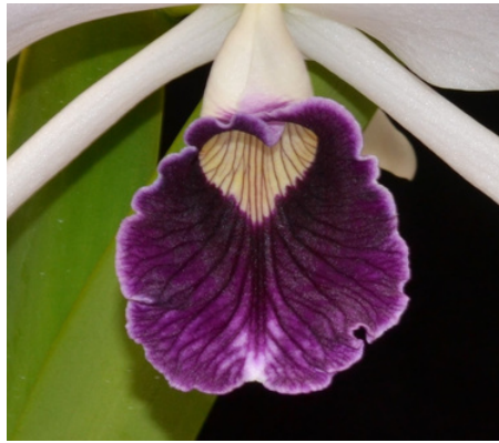
There are a couple different types of blues in purpurata lips, variously called coerulea, roxo-violeta, or Werkhauseri. This is the roxo-violeta type.