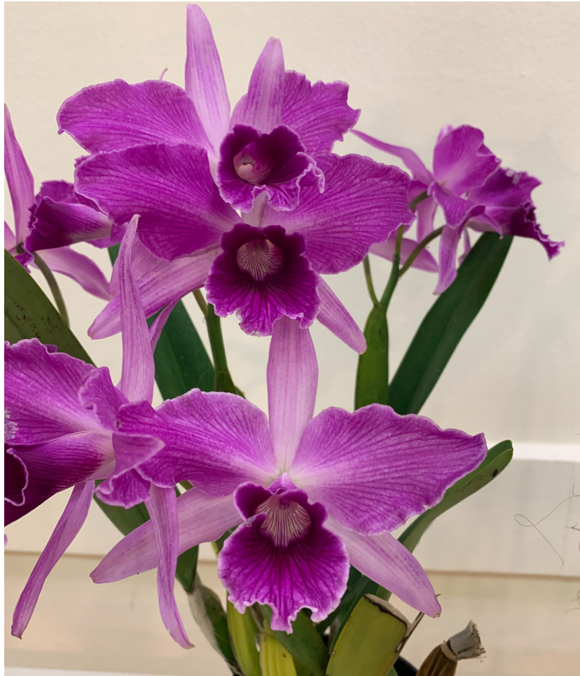
Clockwise from top left: Mystacidium capense (Chaunie Langland), Brassovola nodosa 'Big Deal' AM/AOS (Tom Waugh), Cattleya purpurata (Chaunie Langland), and Laeliocattleya Acker's Spotlight Pink Lady (Tom Waugh)