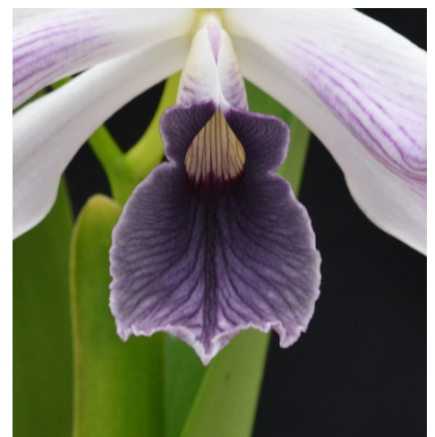
Another Werkhauseri lip, this time with no white notch, and a discernable white margin.