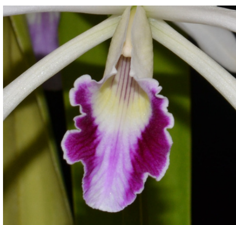
Also named for the placement of the color on the lip is the oculata (eyes) form. This happens when the white patch on the lip becomes so prominent that it actually splits the color on the lip to two distinct patches, one on either side, resembling 'eyes'.