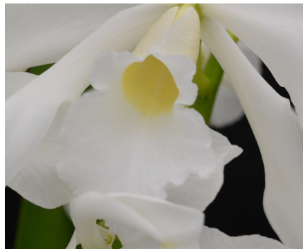
Another alba lip with slightly darker yellow suffusion in the throat.