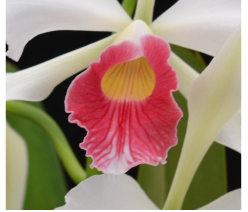
Still a little darker, and the color tone is also a little different.