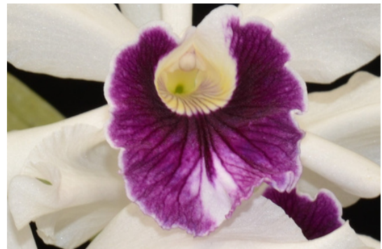
This could be classified any of several different lip types, as the color straddles the fuzzy boundaries between types. I'll lump it with roxo-violeta. Note that most of the roxo-violeta lips on purpuratas also have a very fine white margin, so some growers might term them roxo-violeta marginata.

The other prominent type of blue is either referred to as Werkhauseri for growers in South of Brazil, or coerulea for growers closer to Sao Paulo.