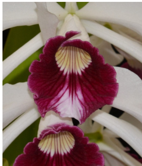
Vinicolored lips can go darker.