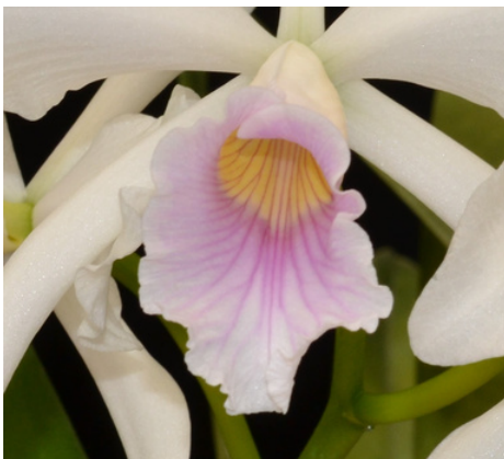
Another light colored carnea lip of the russelliana type, but this one shows stronger venation.