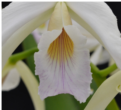
A very pale russelliana type with most of the color at the outer margin of the lip. This might also be termed delicata.