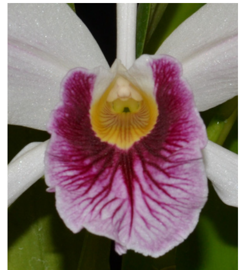
Or they might be a little more rose toned and very strongly veined.