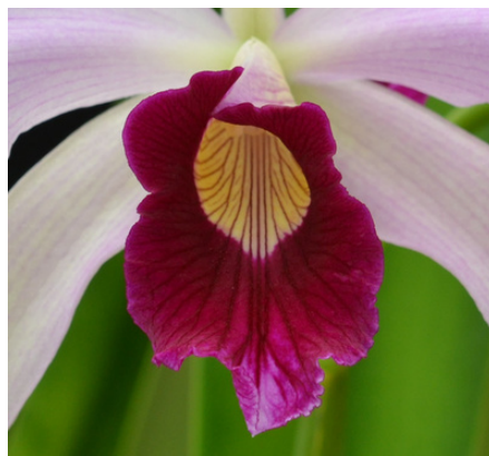
Here's an example with less of a notch, but clearly a reduced color portion of the lip.