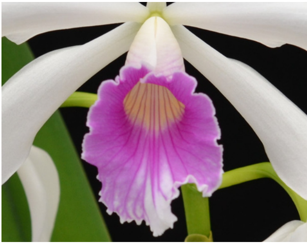
There are some colors that have not been well classified, such as this 'Josephine' (or Josefina) color. A little stronger and it would be roxo-bispo (the color of the bishop's robes), but in this saturation it doesn't fit in any category. This color is rarely seen.