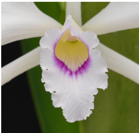
This is the little ring form.

Some lips are classified by the placement of the color on the lip, rather than just the lip color. The annelata form, or ring form, has a full ring of color on the outer throat of the lip, but no color on the main portion of the lip.