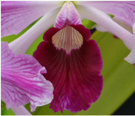
This lip qualifies as being relatively dark, and not having the white notch, but it can't be classified as atro since the other flower segments are not white.