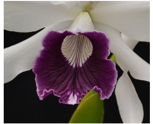
Another roxo-violeta lip.