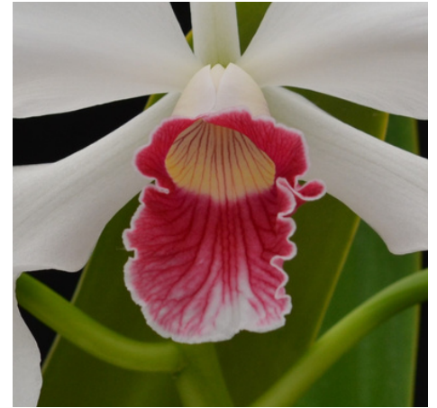
This is about as dark as the carnea lip color goes, and is sometimes called ceriso. Note that there's still a definite pink, and perhaps even a salmon tone to the color.

If we go further in the red direction, we lose most of the pink tones and all the salmon ones, and end up with a vinicolored lip, a relatively rare color in purpuratas .