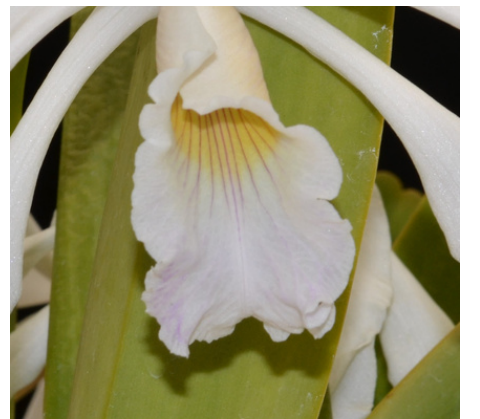
An extremely pale delicata lip, to the point where it's almost white.