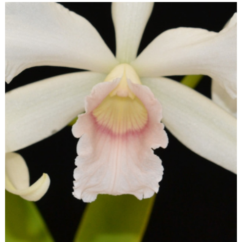
Still lighter might still be called russelliana, although this particular example borders on a carnea form of what's termed annelata (covered further down).