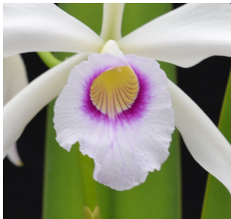
A slightly wider ring.