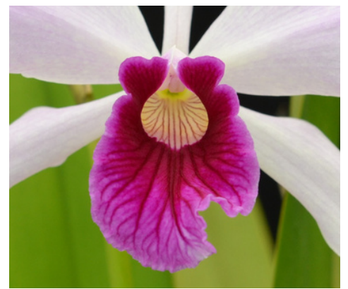
And here's a typical colored lip with no notch at all, just a less intensely colored lip where the venation can be clearly seen.

Next, we'll cover alba lips, as they're pretty straightforward. Note that alba doesn't mean all white for orchids, but rather the lack of antho-cyanin production in the flower (and the plant). Yellow and green are still possible in alba flowers. In some older tomes, this color form is termed virginalis , as the term alba was originally given to another color form of purpurata (that wasn't alba, interestingly, but rather a very pale pink).