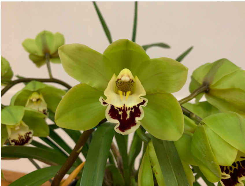
Top: Cymbidium Green Sour 'Fresh' (Mariko Nagashima) Bottom: Cymbidium Eaglewood 'Kana', AM/AOS (Chaunie Langland)