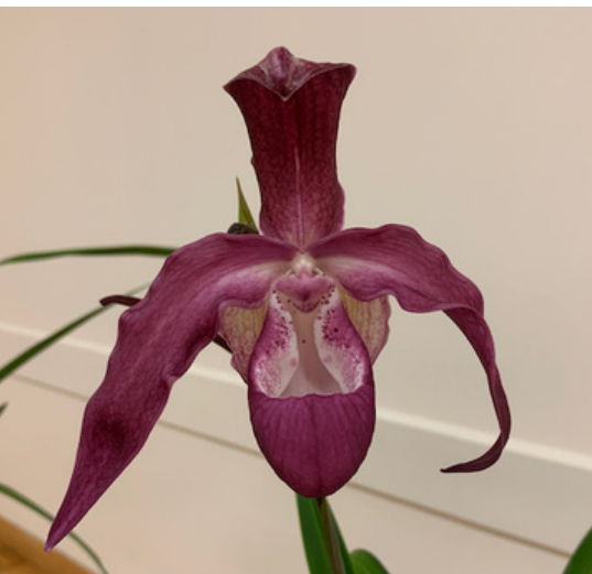
Top to bottom: Paphiopedilum philippinense var. laevigatum (Chaunie Langland), Brassocattleya Gulfshore's Beauty (Tom Waugh), and Pragmipedium Incan Treasure (Chaunie Langland).