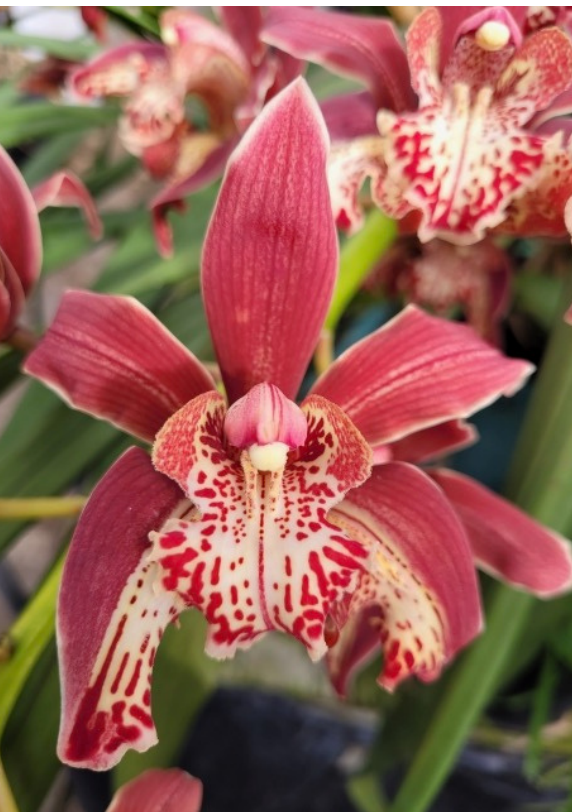
Top: Cymbidium Mainstem 'Hip Hip', Audrey Young-Tarter