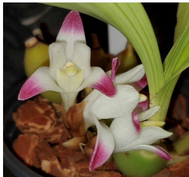
Coeila bella, Audrey Young-Tarter