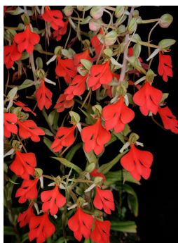
Habenaria rhodochela 'Nuanu' FCC/AOS