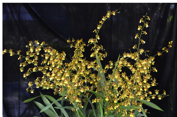
July 17