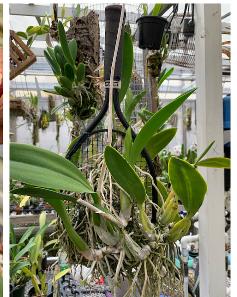
Top: Tom in his greenhouse Bottom: Orchid growing on shoe, Stanhopea, Orchid growing on tennis racket