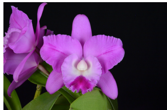
Top 3 photos by Chaunie Langland, June 19