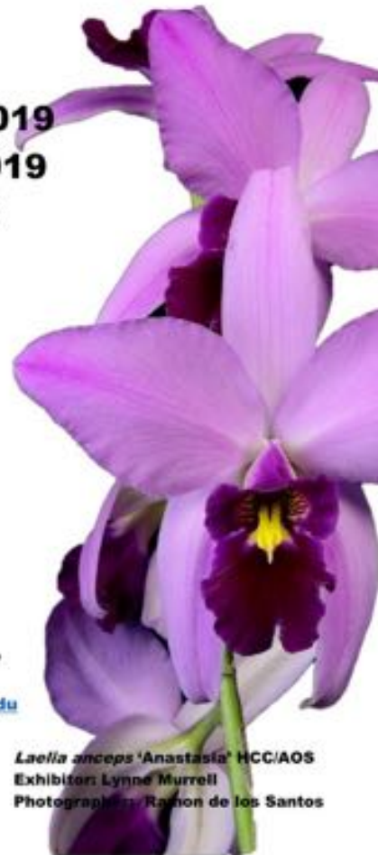
Laelia anceps 'Anastasia' HCC/AOS Exhibitor: Lynne Murrell

There is no cost to attend judging. Standard entrance fees apply to visit Filoli.