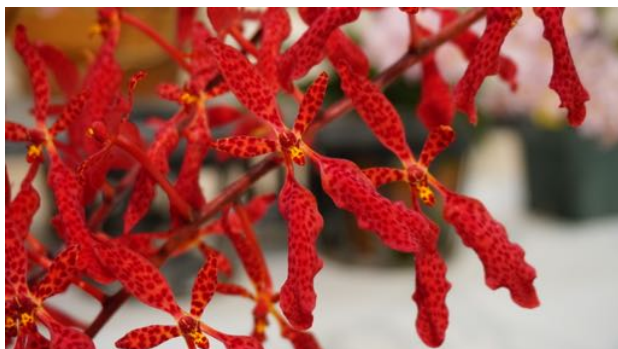
Renanthera hybrid Chaunie Langland