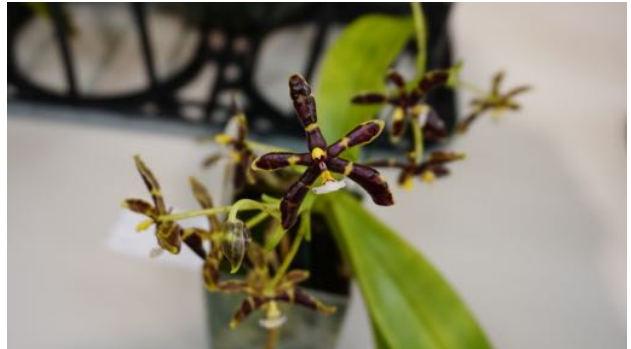
Phal mannii v. mahogany Chaunie Langland