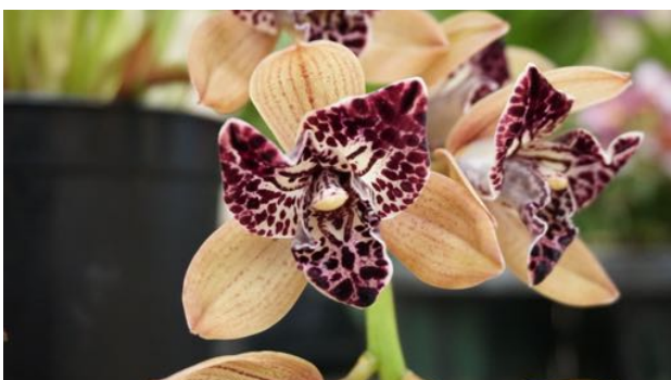
Cym Hot Devon 'Bird of Paradise' grown by Trudy Hadler