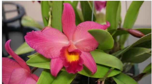
Slc Circle of Life 'Top Catt' x L. anceps 'Feathered Flame' grown by Bill Weaver