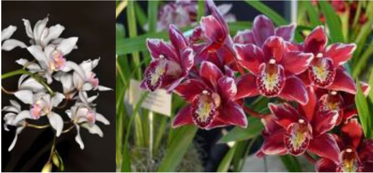
Cymbidium insigne "Lyi", Cymbidium Winter Fire "Splash"