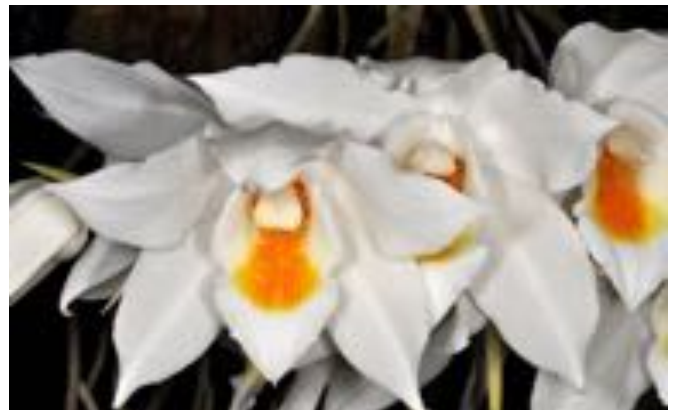
Coelogyne mooreana "Brockhurst" FCC-RHS

This mostly white flowered genus is found throughout Southern and Southeast Asia. The ideal outdoor growing candidates come from the foothills of the Himalayas and higher elevation areas of Vietnam and China. Coelogyne mooreana has large, crystalline white flowers that last for several weeks. Other fine choices include Coelogyne cristata , Coelogyne corymbosa and Coelogyne nitida . All benefit from greatly reduced watering in winter, and are quite cold tolerant as long as they are kept dry.