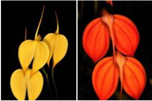
Masdevallia coccinea xanthine & Masdevallia ignea