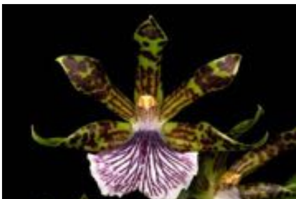
Zygopetalum crinitum