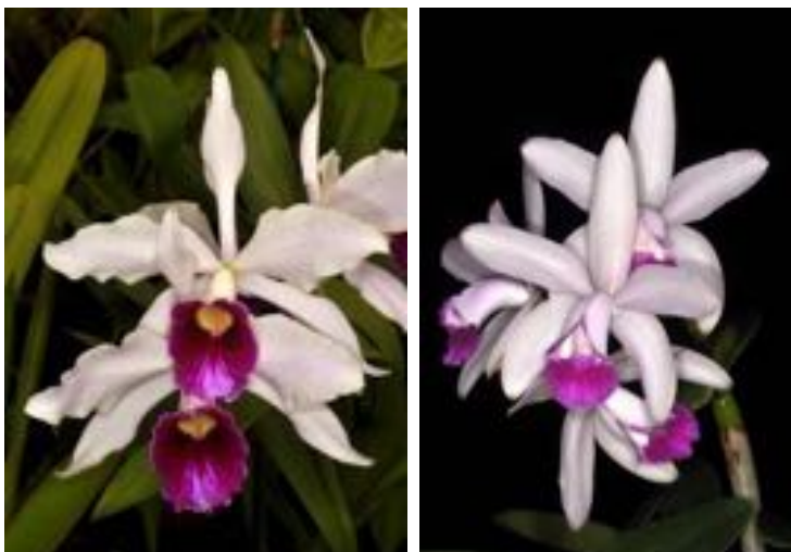
Cattleya (formerly Laelia ) purpurata & Cattleya intermedia

Probably the most familiar orchid grown outdoors in the Bay Area, Cymbidiums come from Asia & Australia and are ideally suited to our moderate temperatures and cool evenings. Preferring bright light and to be kept evenly moist in the summer, most Cymbidiums can handle temperatures down into the mid 20's as long as they are kept on the dry side throughout the winter.