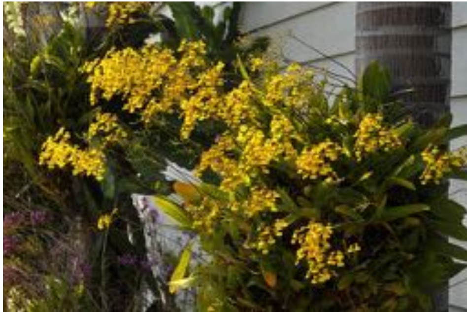
Gomesa flexuosa (formerly Oncidium flexuosum)

While most Vanda and Phalaenopsis species cannot survive outdoors in coastal California, they have some close relatives that thrive under our conditions. Vanda (formerly Neofinetia) falcata, the “Samurai Orchid” is native to Japan and prized there for its diminutive beauty and sweet fragrance. Sarcochilus hartmannii originates in Australia and covers itself in white flowers with pink centers every spring. Vanda falcata does best under medium light levels, while Sarcochilus hartmannii prefers more shade. Both need to be kept drier in winter, with preferably little or no water ever touching their leaves during the coldest months. For the adventurous, Holcoglossum flavescens and Phalaenopsis wilsonii are two additional options that do quite well outdoors, but both require being grown on a mount.