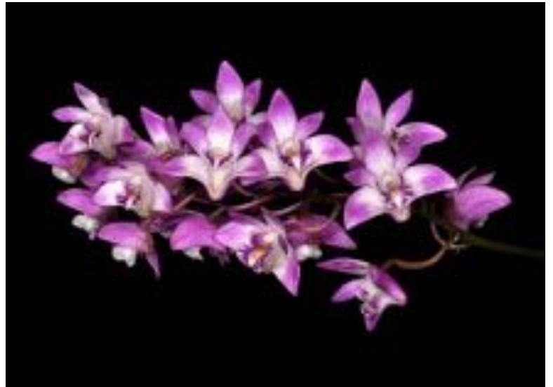
Dendrobium kingianum .

Native to Asia, Australia and some Pacific islands, Dendrobiums come from a wide variety of habitats. Some of the best suited to outdoor culture in the Bay Area come from Australia, the foothills of the Himalayas, Japan and higher elevations in China. Dendrobium kingianum is one of the easiest of all orchids to grow outdoors. Indifferent to all but the most extreme temperatures and tolerant of neglect, this is an ideal orchid for the beginner. Other good choices are Dendrobium moniliforme, Dendrobium speciosum, Dendrobium nobile and