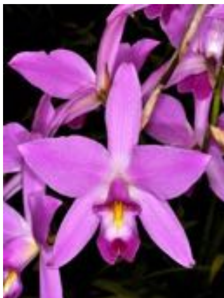
Laelia anceps.

Dendrobium jenkinsii. These last two prefer to remain quite dry in the winter months, actually blooming better if left unwatered between Thanksgiving and Valentine's Day.