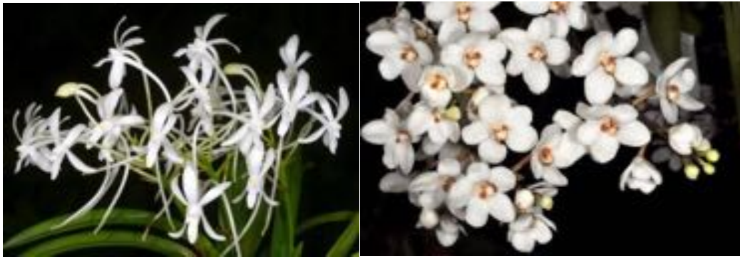
Vanda falcata & Sarcochilus hartmannii