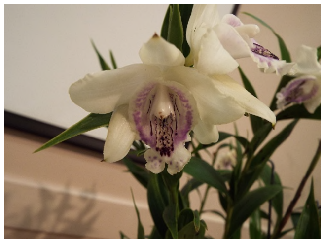
Sobralia maduroi (sp?) - Asuka (3 rd time to bloom in 21 years)