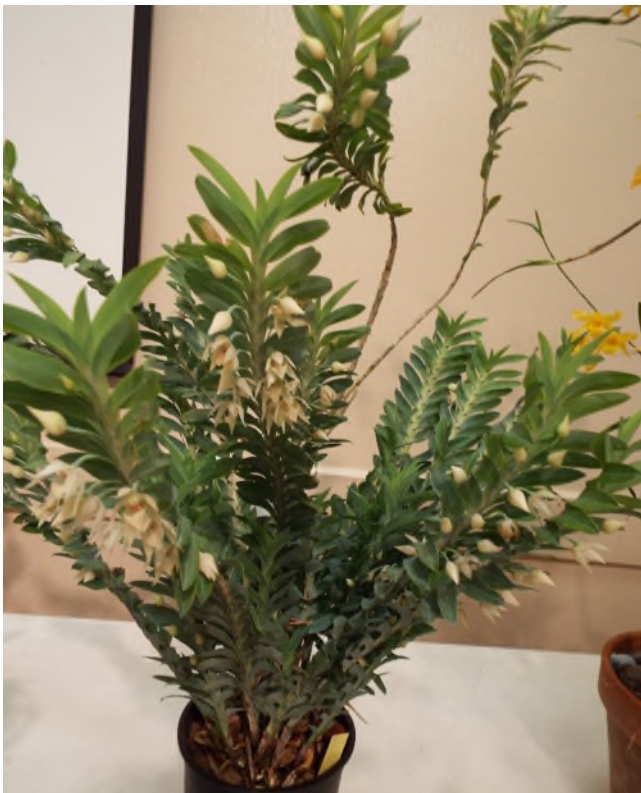
Diachea glauca -