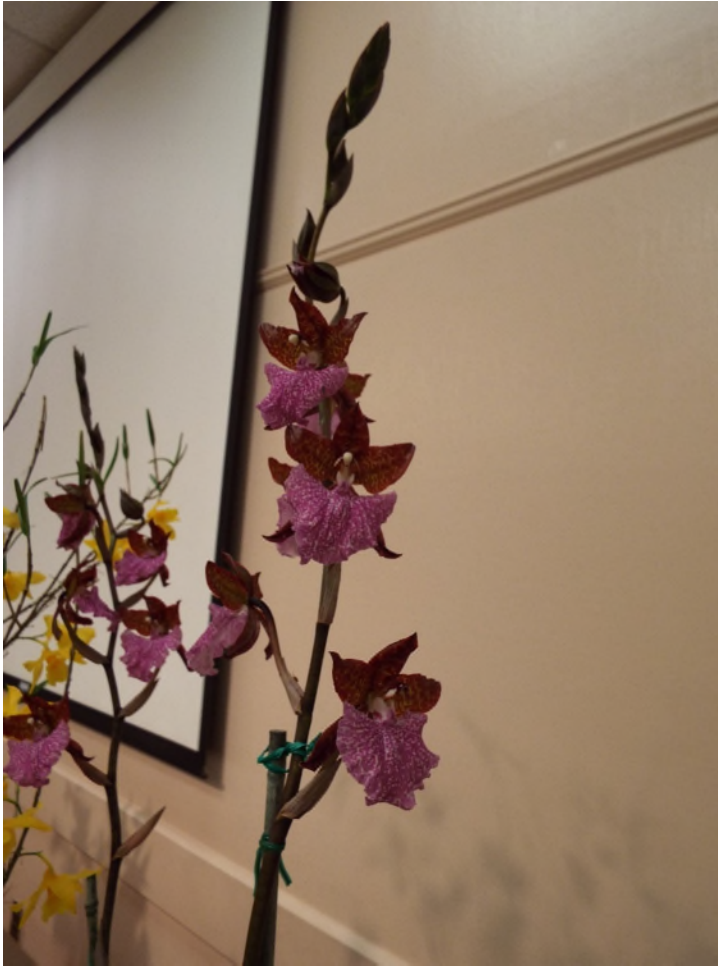
Odont cordata - Asuka