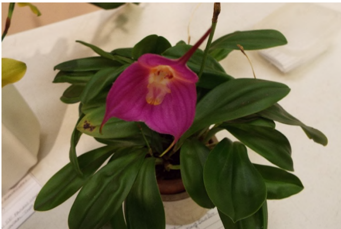
Dracuvallia Blue Boy 'Cow Hollow' – Linda Tripp