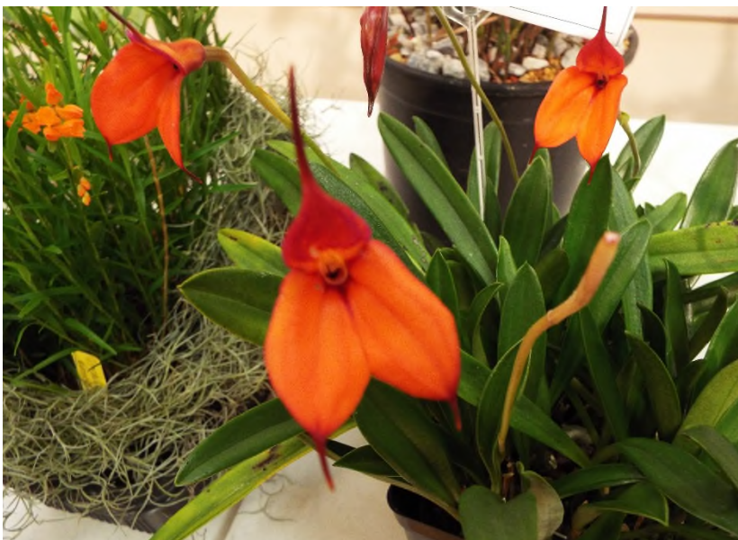
Masd. Welischii 'Rip-Hoff' - Asuka