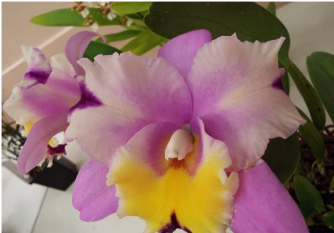
Lc. Irene's Song 'Montclair' HCC/AOS - Janusz