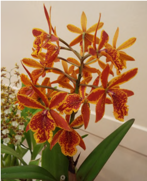
Lc. Irene's Song 'Montclair' HCC/AOS - Janusz