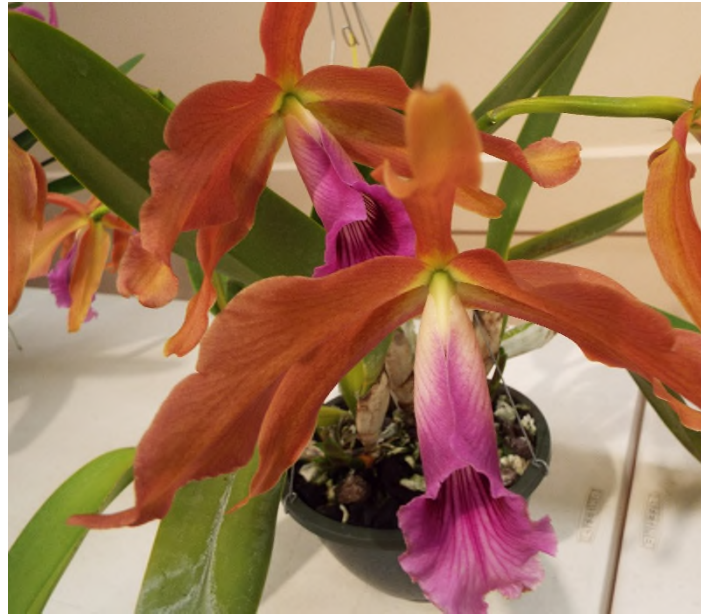
L. tenebrosa