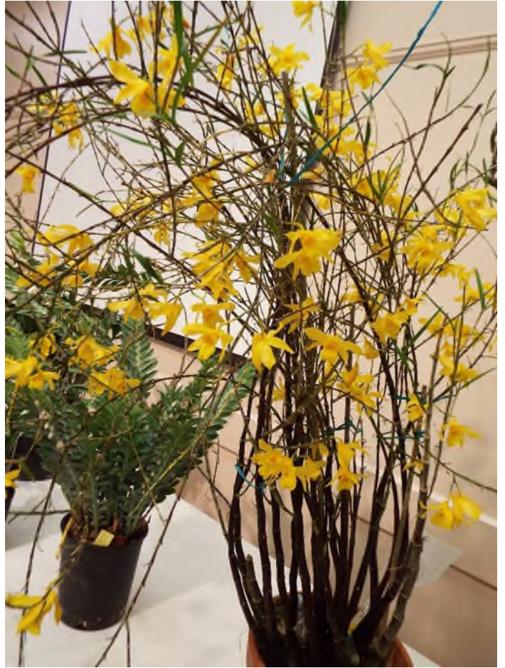
Den. hancockii - Asuka