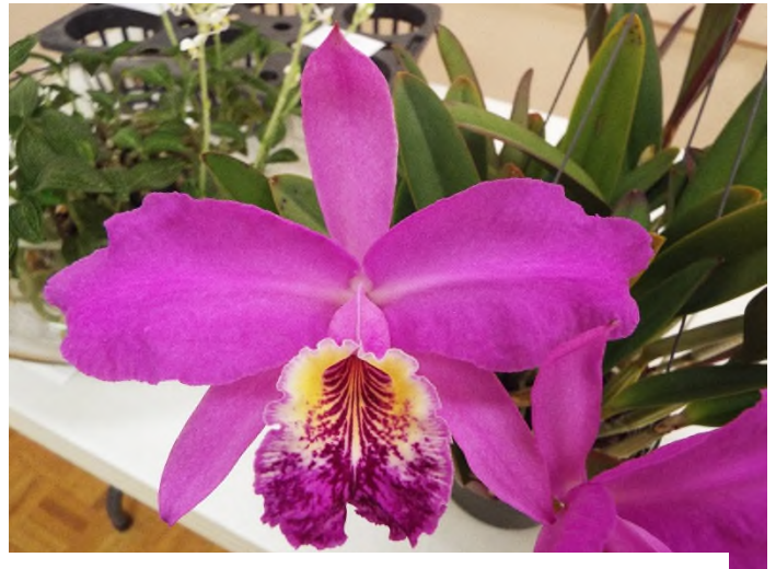
C. leuddemaniana – (another view)