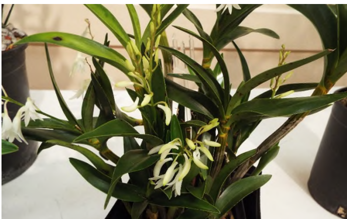
Dendrobium moorei - Asuka