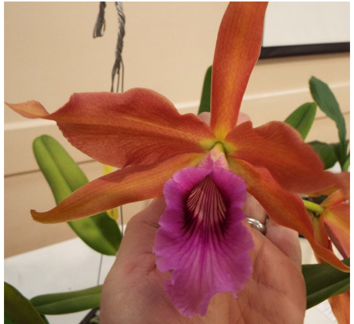
L. tenebrosa