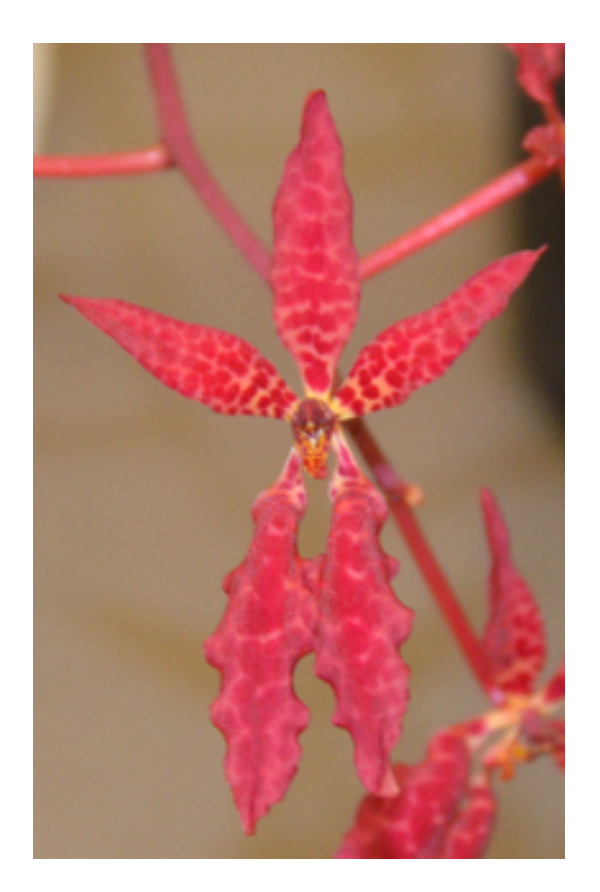
Renanthera imschootiana Chaunie Langland