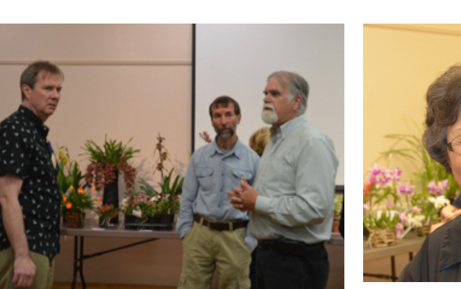
Our Prez, our speaker and our VΡ