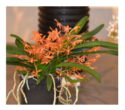
Ascofinetia Cherry Blossom