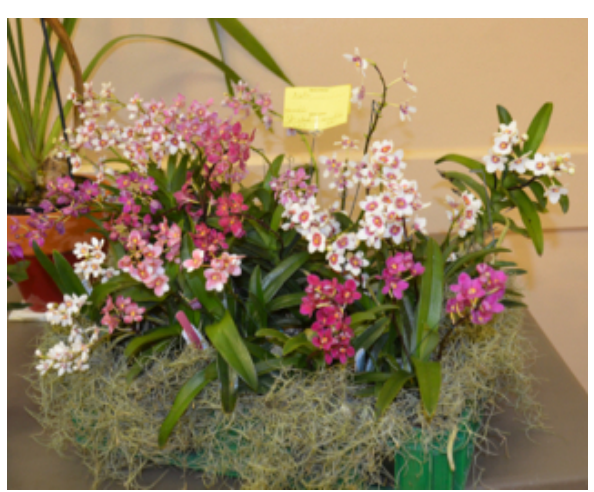
A nice selection of Sarcochilis Asuka