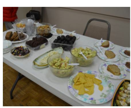
in by Rex Castell