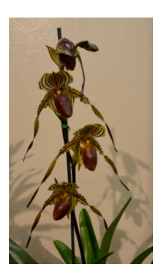
Missed the tag