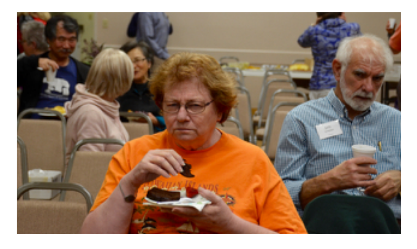
Some seek to discourage the lady with the camera