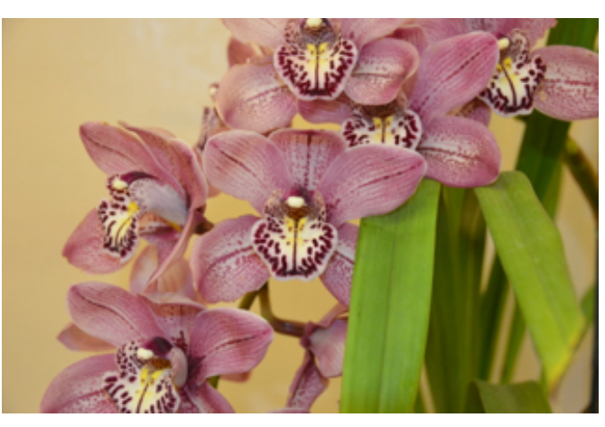
Cymbidium Spotted Leopard 'Winston' Rex Castell