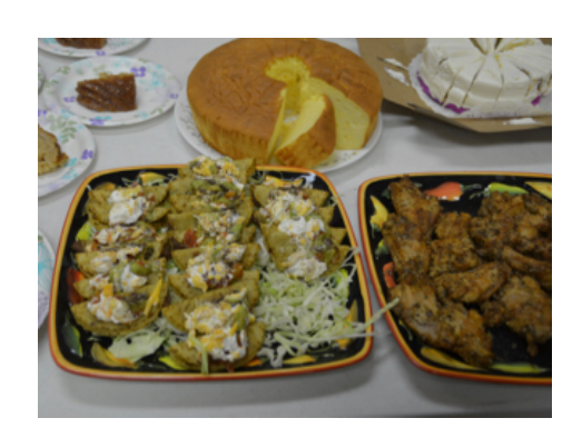
Gourmet tacos and chicken brought