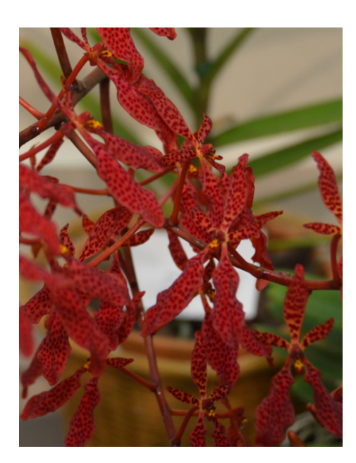
Renanthera no name Chaunie Langland