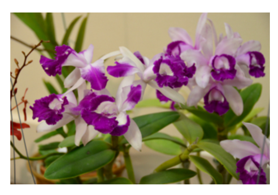
A nice selection of Cattleya intermedia brought in by Amy Chung