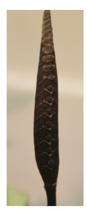
Bulbophyllum purpureorchis