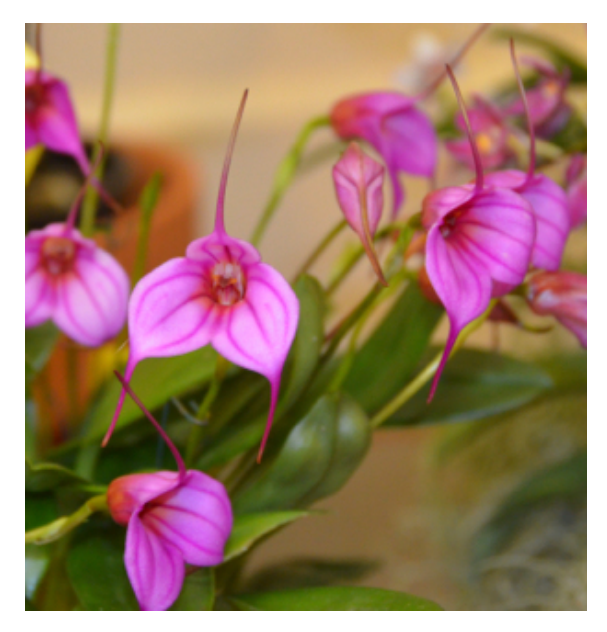
Masdevallia Carousel Asuka