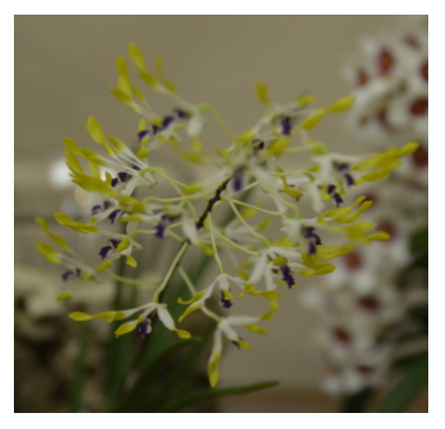
Dendrobium canaliculatum