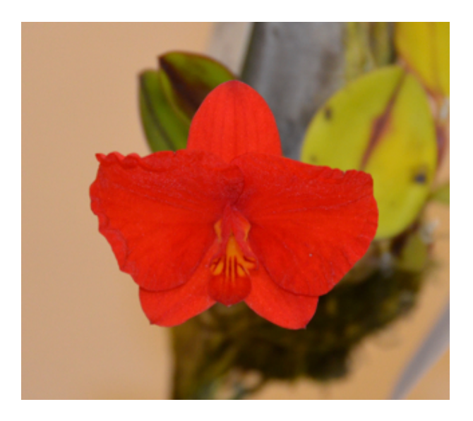
Cattleya coccinea