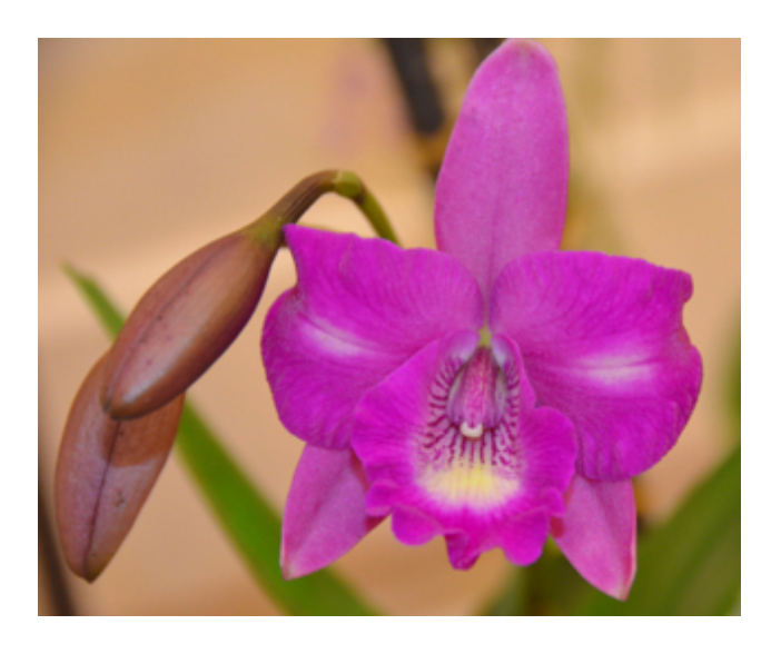
Slc. Tropical Song x L. anceps