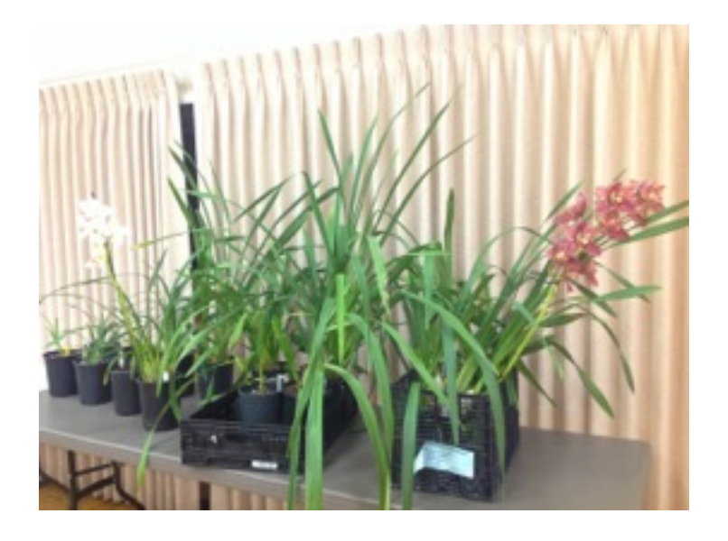
Our great opportunity table.