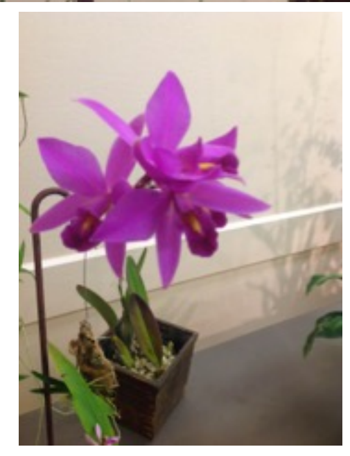
Fantastic Photos by: