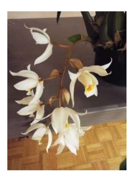
Figure 1 Coelogyne Jean Banks 'Snow White' HCC/OSNSW