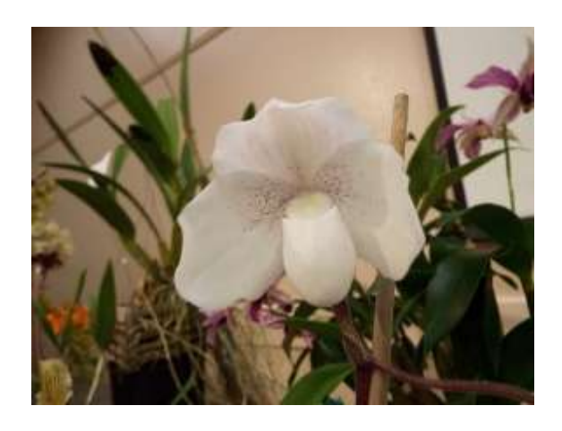
Paph. niveum grown by Jason Liu 1