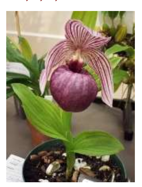
Cypripedium tibeticum from Leo Kusber