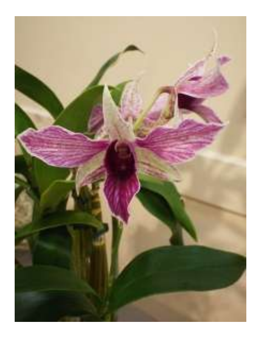
Figure 3 Dendrobium Fire Wings by Gloria Bygdnes