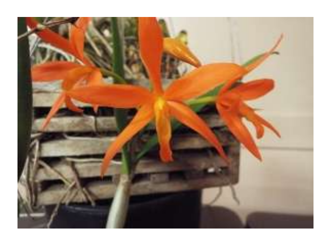
Figure 5 Laelia Harpophylla 'Mayan Fantasy' from Roey Shaviv