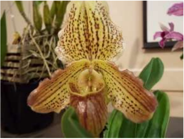
Figure 7 Paph fairrieanum X Wall Crest from Carol Klonowski