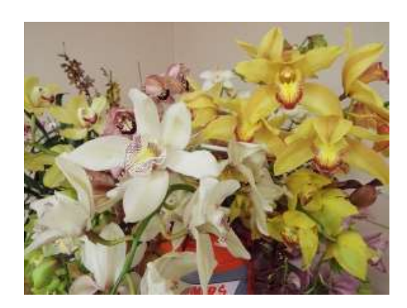
Figure 2 Misc. Cymbidiums from Bill Weaver