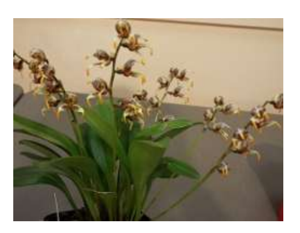
Masdevallia pachyura cf. caudes orange from T& M Boomer