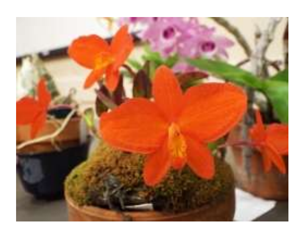
Cattleya coccinea