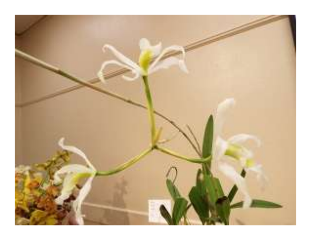
Figure 6 Schomburgkia superbiens alba 'Don Hubert Cross'