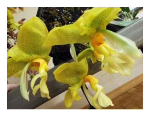
Figure 4 Stanhopea costaricensis from Bill Weaver from C. Todd Kennedy.