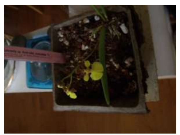
Cohniella sp., perhaps cebolleta, from wild-collected seed,