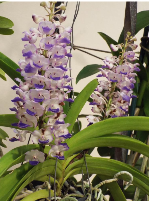
Rhychostylus incongnito from Neal Winslow