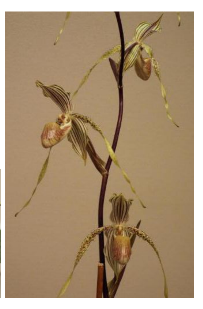
Phrag. Kovachii X Phrag. schlimii from the Boomers