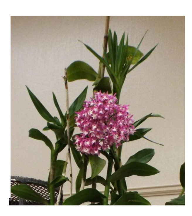
Epidendrum parphyreum from Asuka