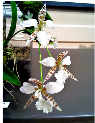
Rhynchosele ehrenbergii Neal Winslow