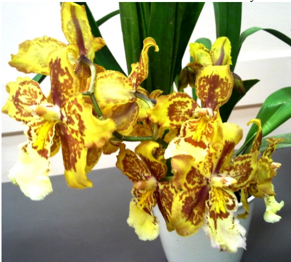
Oncidium Tiger Crow 'Golden Girl' HCC/AOS X Oda. Nichitei Sunrise HCC/AOS Janusz Warszawski