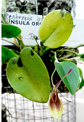
Restrepia Iris Luer