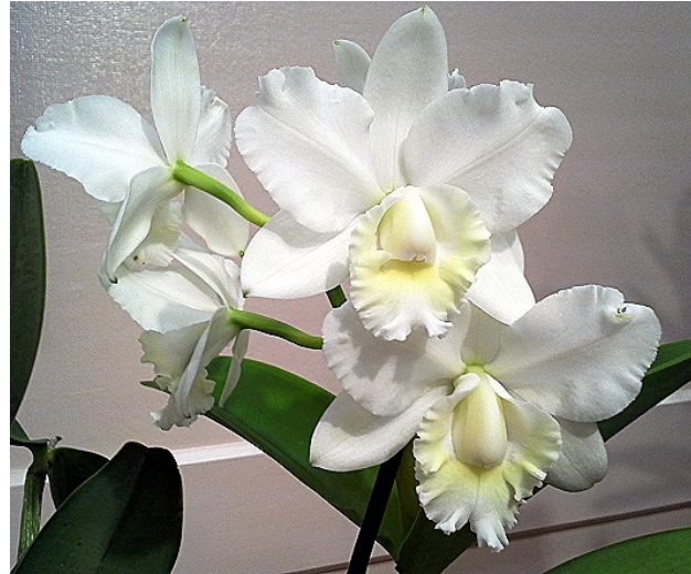
C. loddigesii 'Streeter's Alba' - Amy Chung