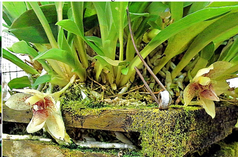
Stenia Vasquezii