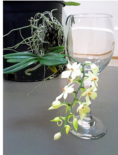
Aerg. Luteo Alba Rhodosticta Rosalie Dedo