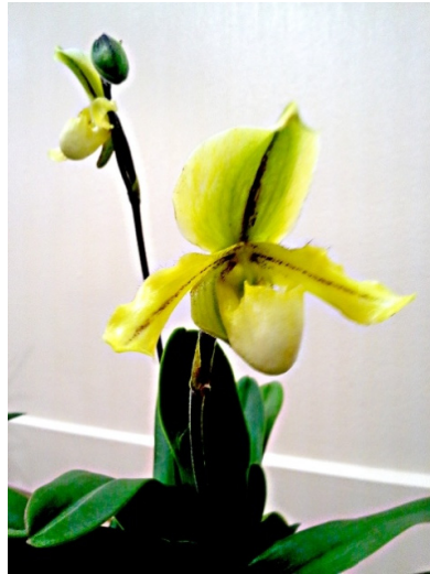
Paph Druid Spring (primulinum 'Lunar Glow' x Druyi 'Bold Stripe')