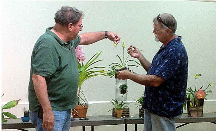
All the king's horsemen...