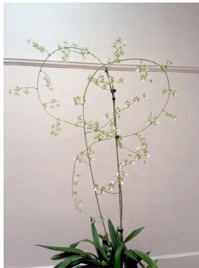
Oncidium Leuchochilum Neal Winslow