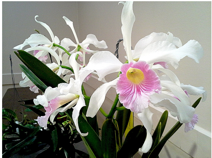
Cattleya Purpurata var carnea 'Josie's Choice' (from ___?)