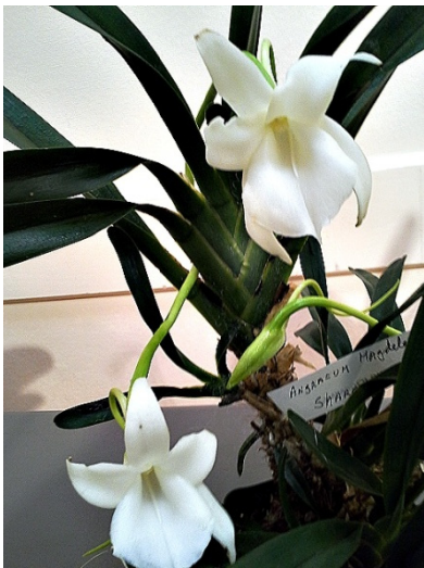
Angraecum magdalenae