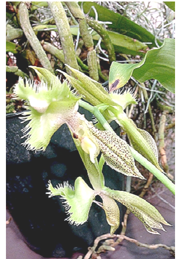
Catasetum (?) Sung Lee