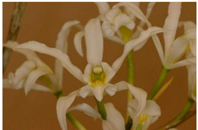
Laelia superbiens 'Alba' Bill Weaver