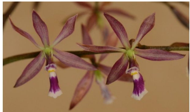
Encyclia Summer Perfume 'Tropical Tinge' Tanya Lam