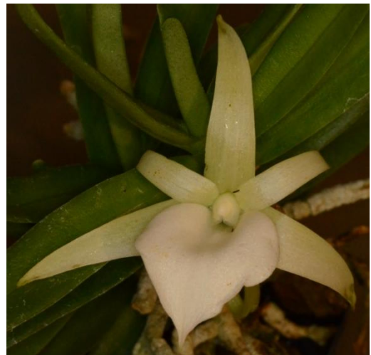
Angraecum dideri The Boomers