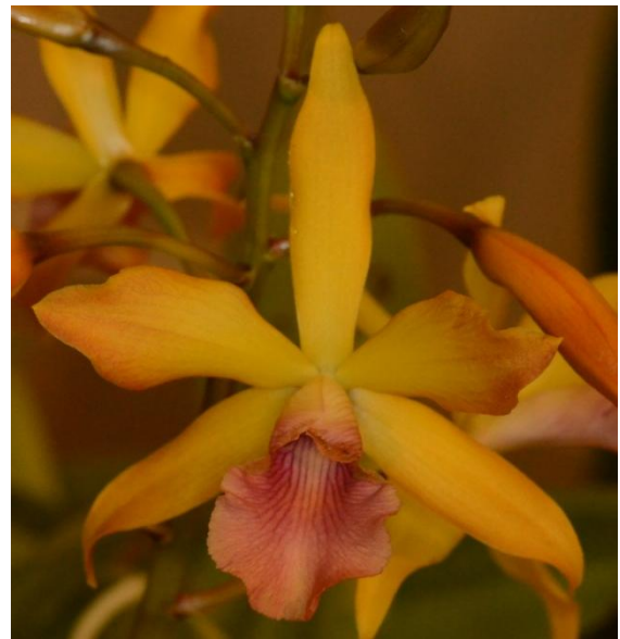
Cattlianthe Orange Crush '#1' Bill Weaver