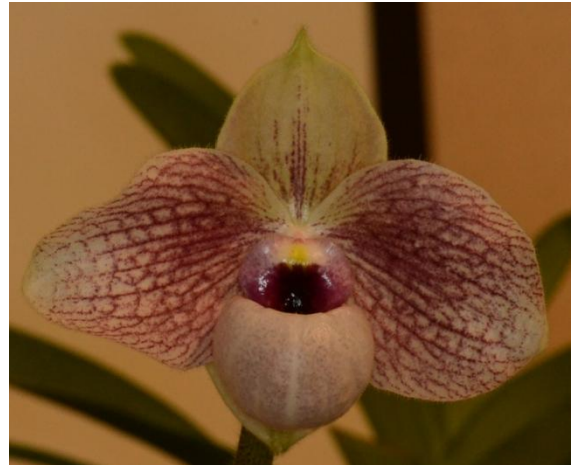
Paphiopedilum Lynleigh Koopowitz Tanya Lam