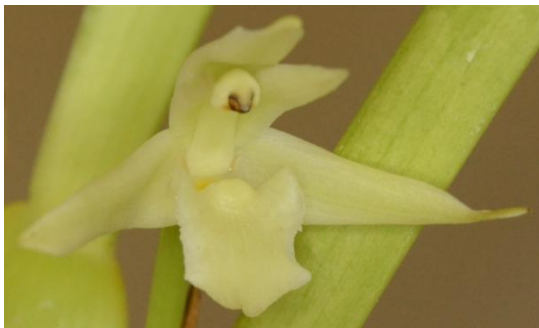
Unknown Maxillaria