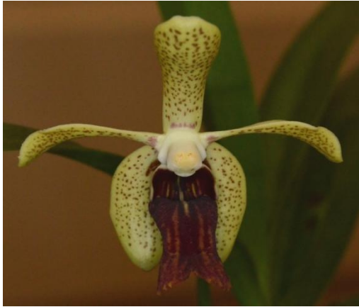
Vanda (Paki x Bill Burke)