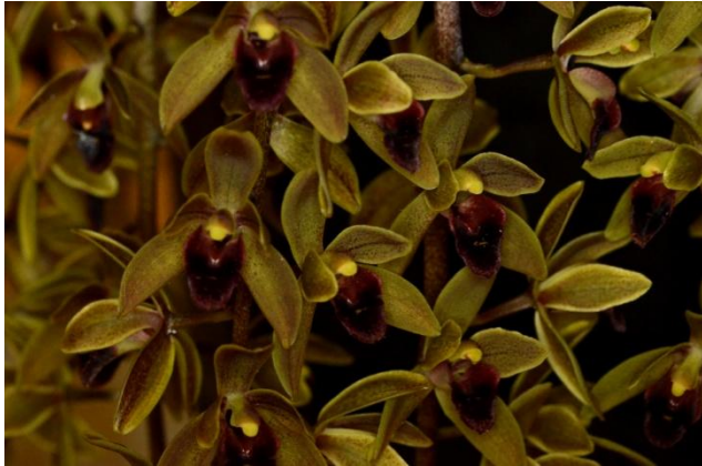
Cymbidium Sweet Devon 'Sweet' Tanya Lam