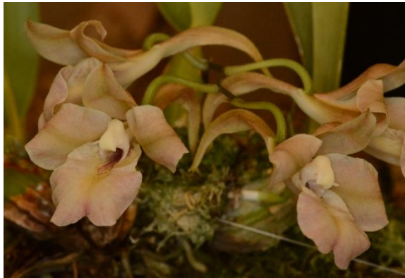
Rodriguezia leeana The Boomers