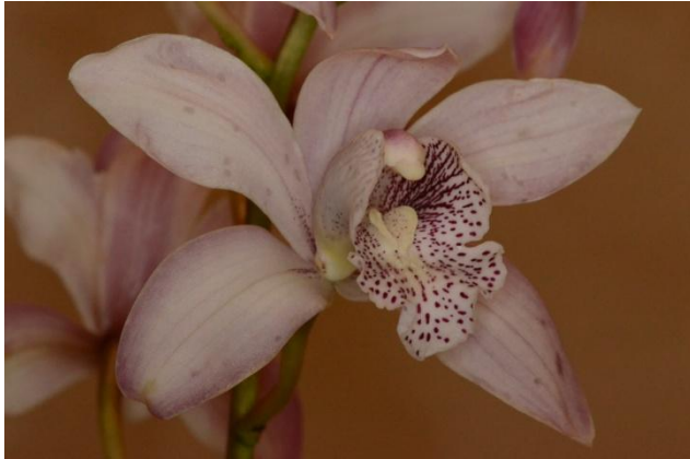
Cymbidium cooperi 'Plush' Jeff Trimble