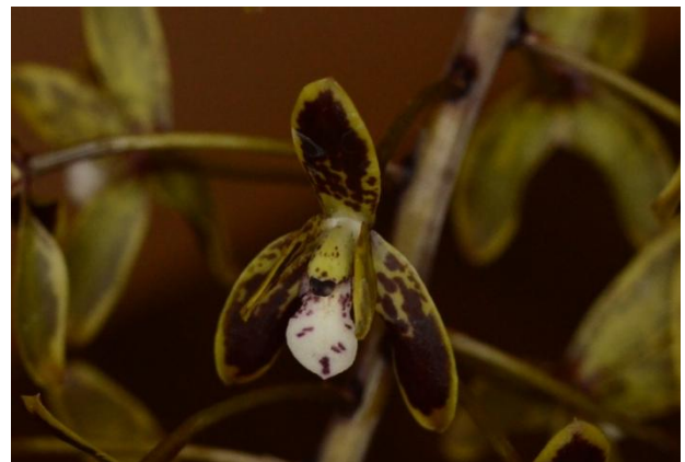
Cymbidium canaliculatum 'Alice' Jeff Trimble