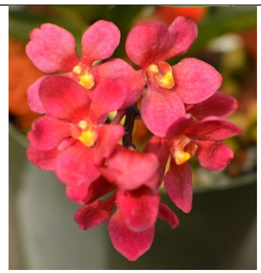
Sarcochilus Royale Red 'Woodside' Pierre Pujol