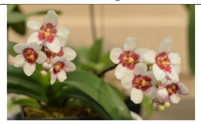
Sarcochilus (Sweet Melody x Hot Ice Pink Perfection) Dan Williamson