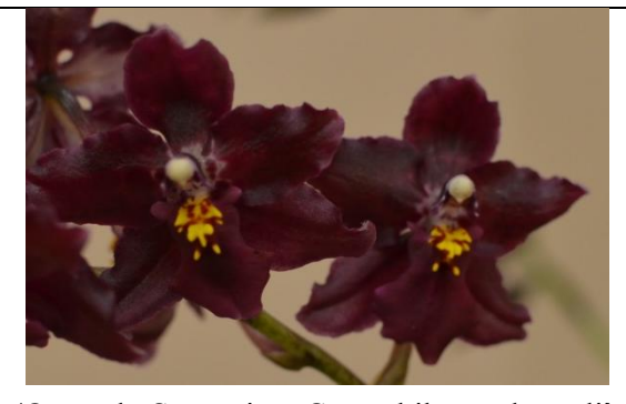
(Otostele Summit x Cyrtochilum\ edwardii ) Neal Winslow