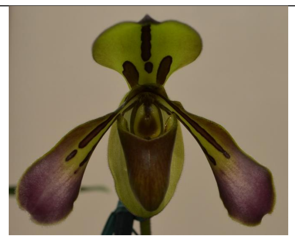
Paphiopedilum tigrinum