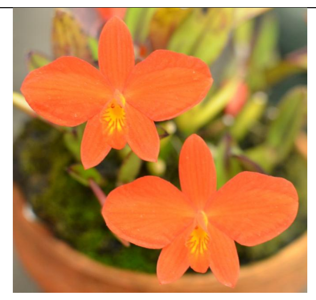
Cattleya coccinea