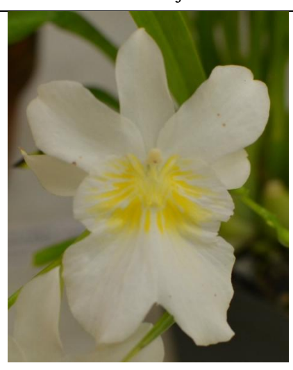
Miltoniopsis phalaenopsis alba Neal Winslow