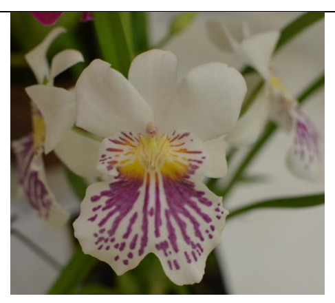
Miltoniopsis phalaenopsis Neal Winslow