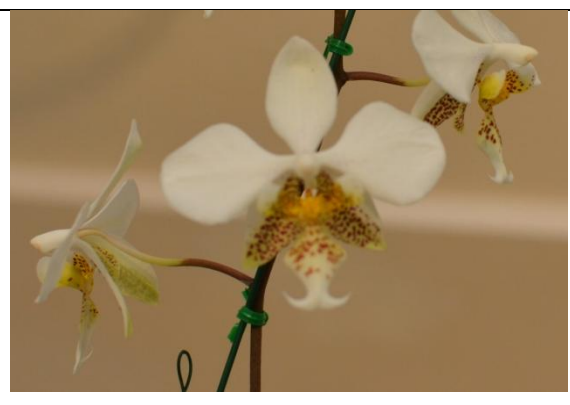
Phalaenopsis stuartiana Chaunie Langland