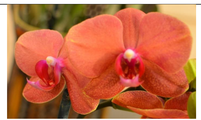
Phalaenopsis Surf Song Nan Orman