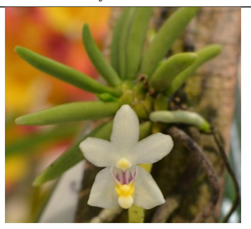
Pterocerus semiteretifolium Donna Horn