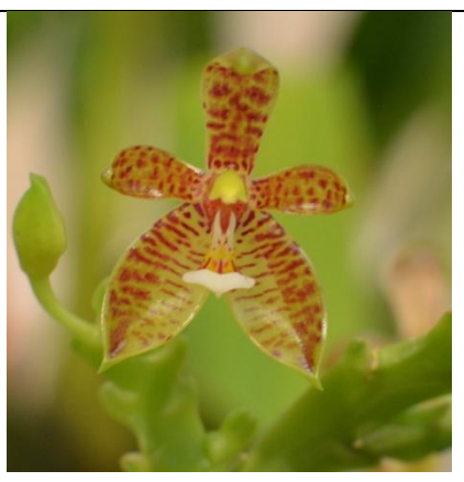
Phalaenopsis cornu-cervi Gloria Bygdnes