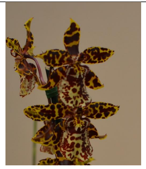
Oncostele Wildcat 'Leopard' Gloria Bygdnes