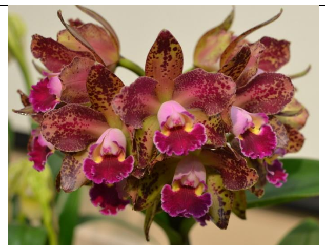
Rhyncholaeliocattleya Waianae Leopard 'Ching Hua' HCC/AOS Pierre Pujol