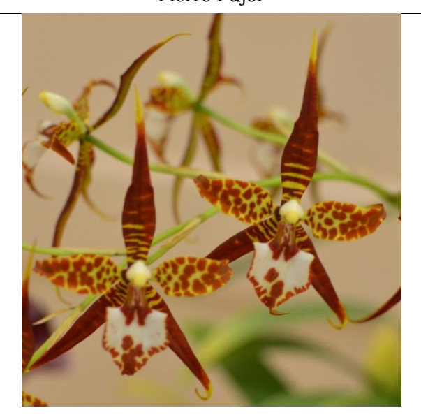
Rhynchostele cordata Neal Winslow