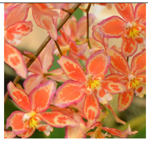
Oncidium Jacob's Coat