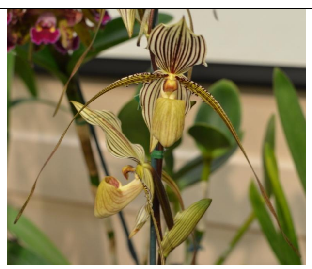
Paphiopedilum Saint Swithin Pierre Pujol