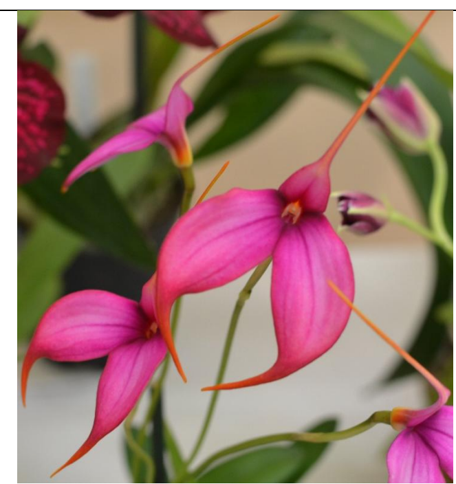
Masdevallia Ziegler's Love 'Glowing Pink' AM/AOS Neal Winslow