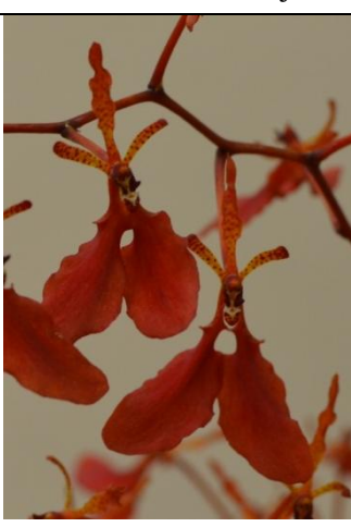
Renanthera imshootiana