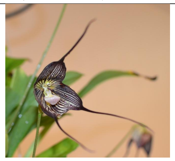
Dracula vampria Chaunie Langland