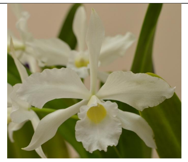
Cattleya purpurata 'Equilab' AM/AOS C. Todd Kennedy