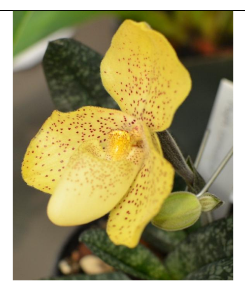
Paphiopedilum concolor Pierre Pujol