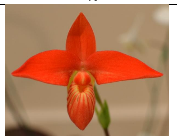
Phragmipedium besseae Chaunie Langland