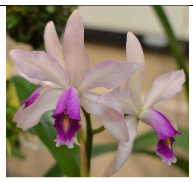
Cattleya Superforbesii Pierre Pujol