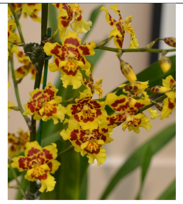
Oncidium Pacific Passage 'Peach Cobbler' Neal Winslow