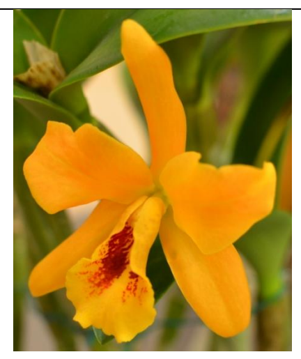
Cattlianthe Gold Digger Ann Rigel