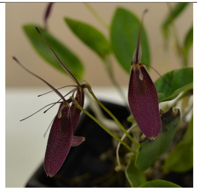
Restrepia contorta Chaunie Langland