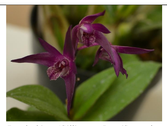
Dendrobium (Gillieston Jazz 'Steven' x (Tosca x Rutherford Starburst) 'Red Wine') Unknown Exhibitor