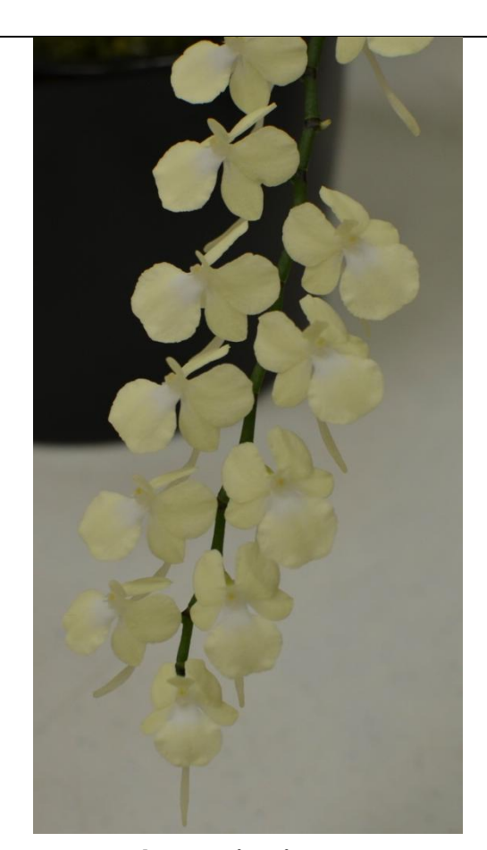
Aerangis citrata Chaunie Langland