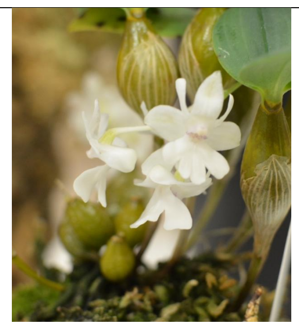
Dendrobium aberrans Chaunie Langland