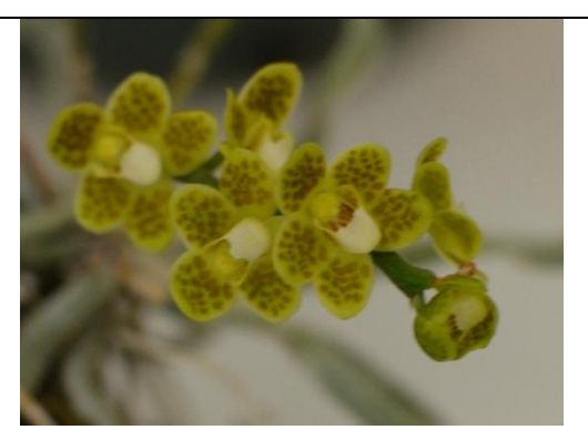
Chiloschista sweelimii