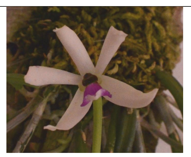
Leptotes bicolor