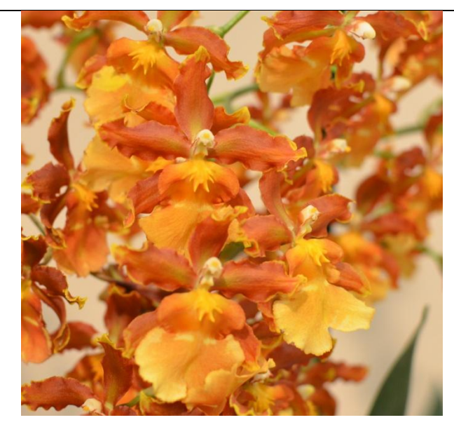
Oncostele Catatante 'Pacific Sun Spots' Pierre Pujol