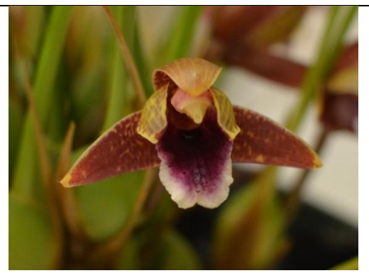
Maxillaria sanguinea