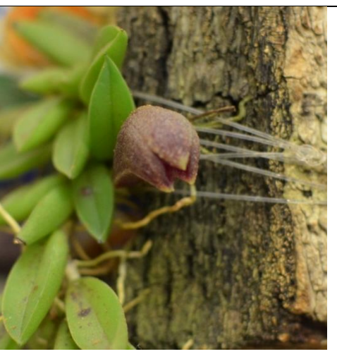
Pleurothallis asaroides