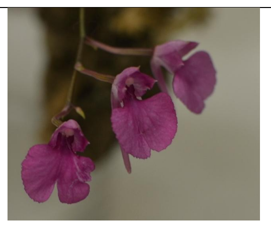
Comparettia falcata Chaunie Langland