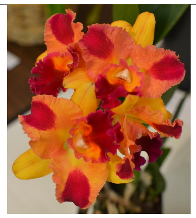
Rhyncattleanthe (Cattleya Golden Elf x Rhyncattleanthe Burana Beauty) Pierre Pujol