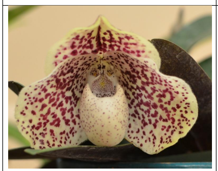
Paphiopedilum (Memoria Richard Steele 'High Round Arch' x S. Gratrix 'Aussie Spots')