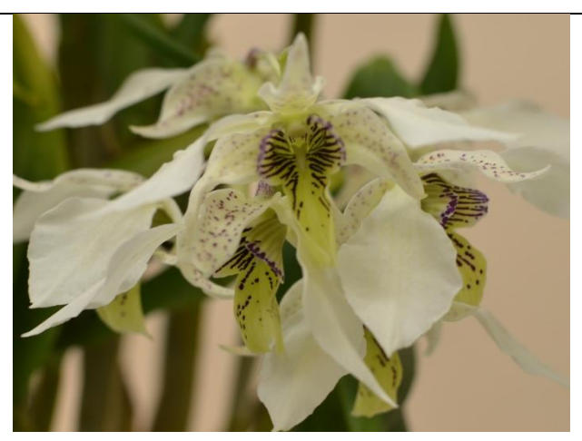
Dendrobium Roy Tokunaga Chaunie Langland