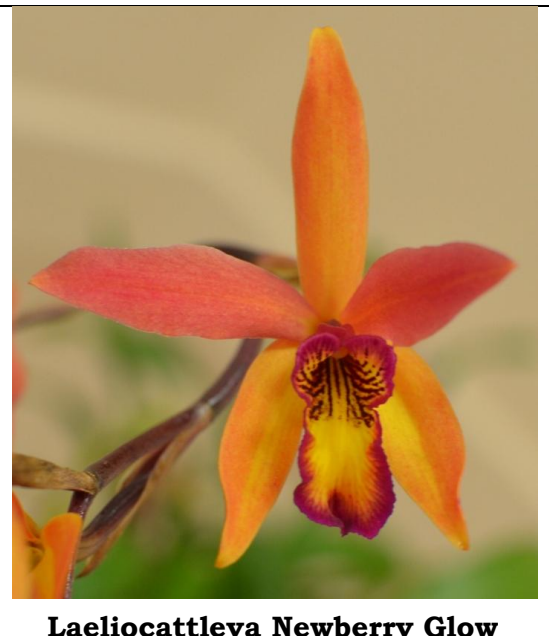
Laeliocattleya Newberry Glow