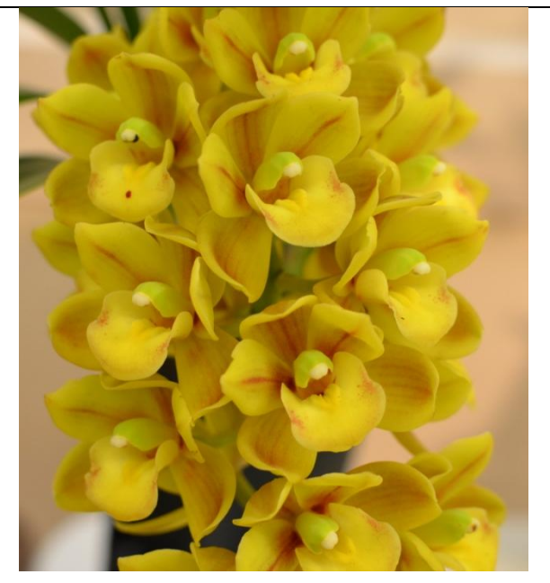
Cymbidium Sunshine Falls 'Butterball' Pierre Pujol