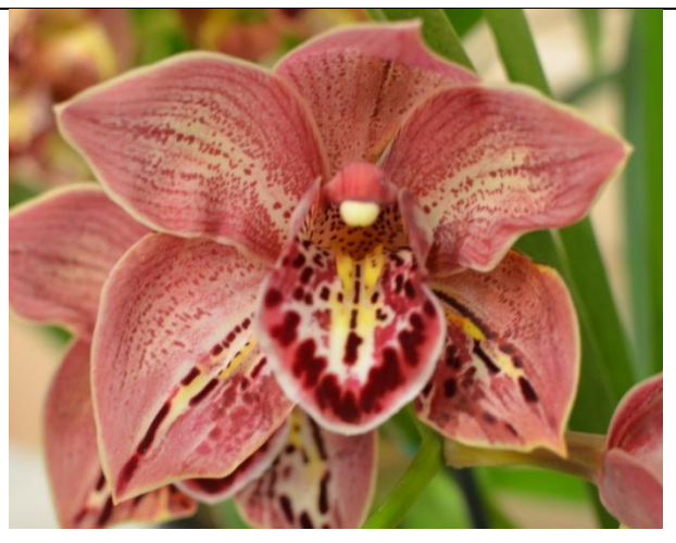
Cymbidium ((Lightning Bolt x Pink Champagne 'Effervescent') x Darch Freak 'Magic Wine') Bill Weaver