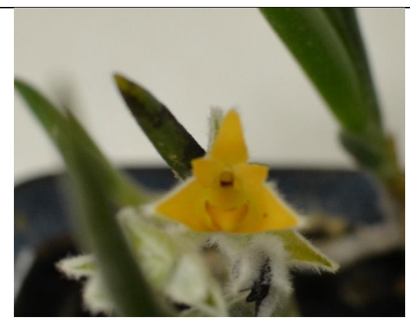
Eria pannea Chaunie Langland