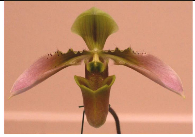
Paphiopedilum appletonianum