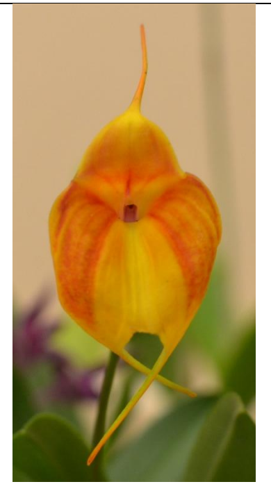
Masdevallia niesseniae