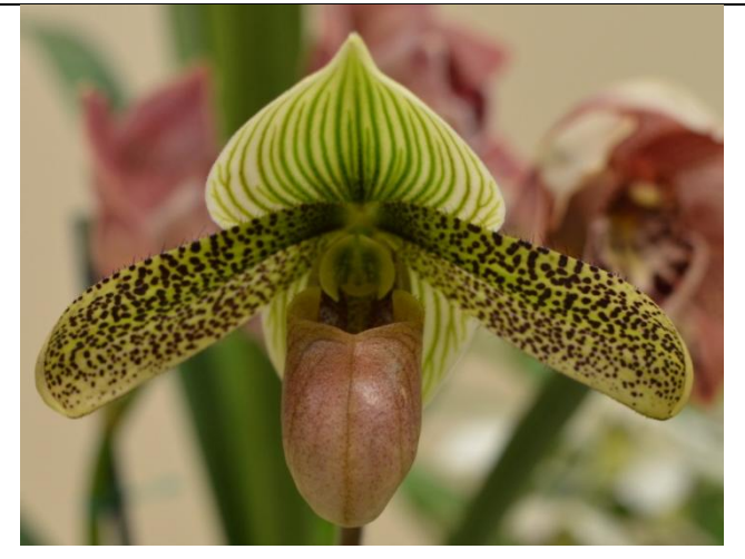
Paphiopedilum French Jewel Jung Hee Ra