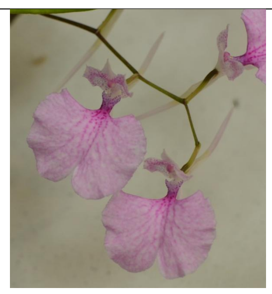
Comparettia macroplectron Chaunie Langland