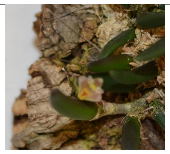
Dendrobium lichenastrum