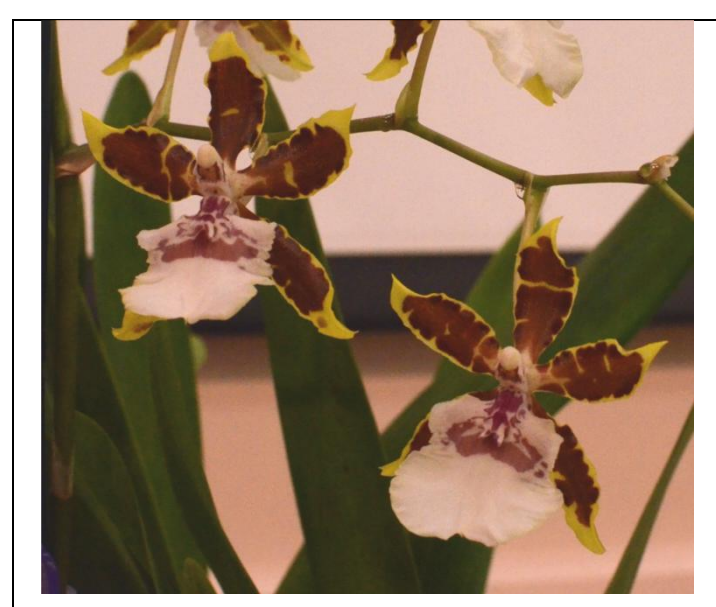
Oncidium Jungle Monarch Gloria Bygdnes