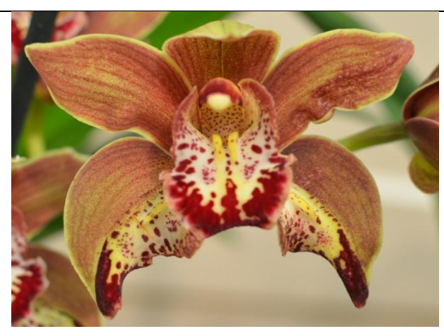
Cymbidium Darch Freak 'Mud in the Eye' Bill Weaver