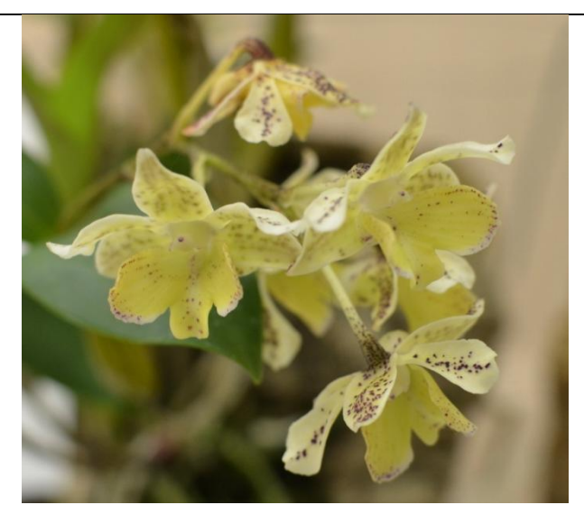
Dendrobium Microchip Chaunie Langland