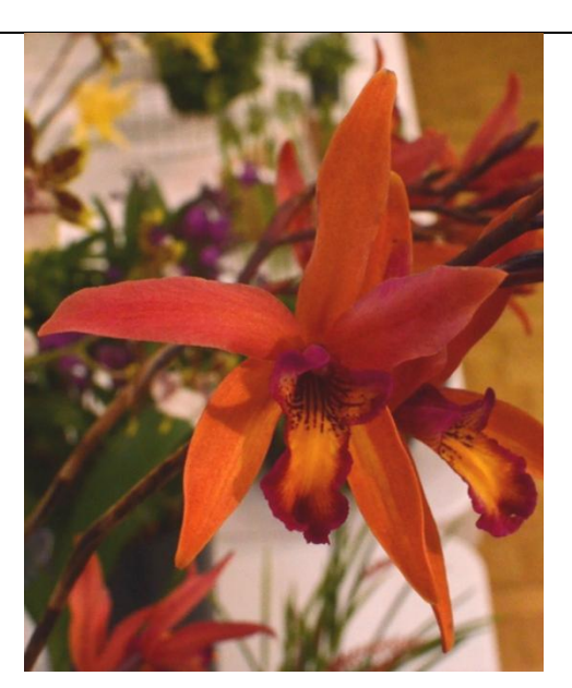
Laeliocattleya Newberry Glow Gloria Bygdnes