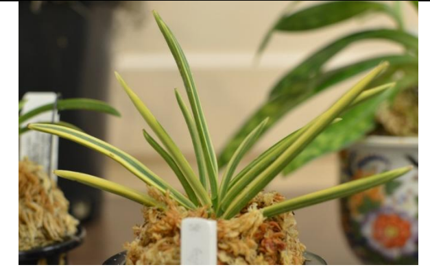
Vanda (Neofinetia) falcata 'Gojyo-Fukurin'