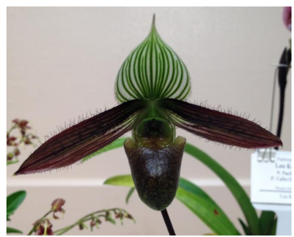
Paphiopedilum wardii var chocolate Unknown Member