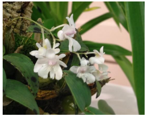
Dendrobium aberrans