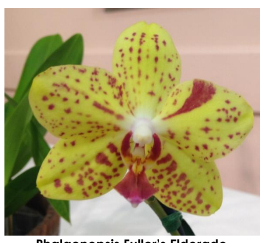
Phalaenopsis Fuller's Eldorado Gloria Bygdnes