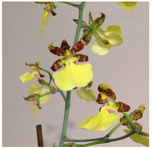
Tichocentrum splendidum Chaunie Langland