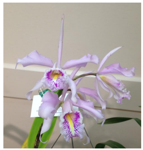
Cattleya maxima