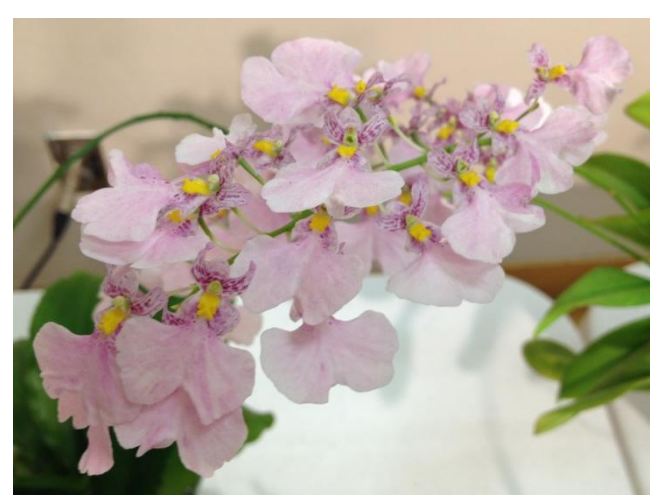
Ionmesa Popcorn Chaunie Langland