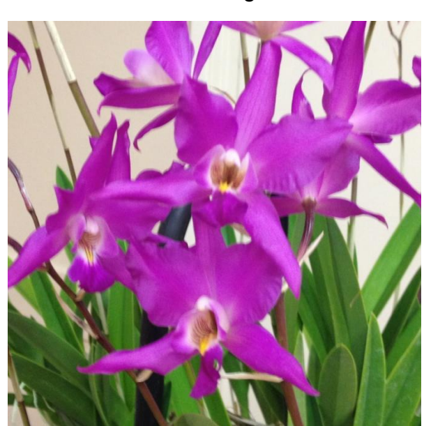
Laelia gouldiana (flower detail)