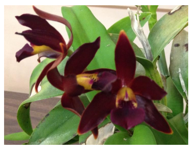
Cattlianthe Chocolate Drop Uknown Member