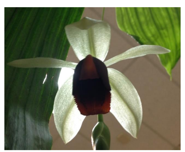
Coelogyne usitana