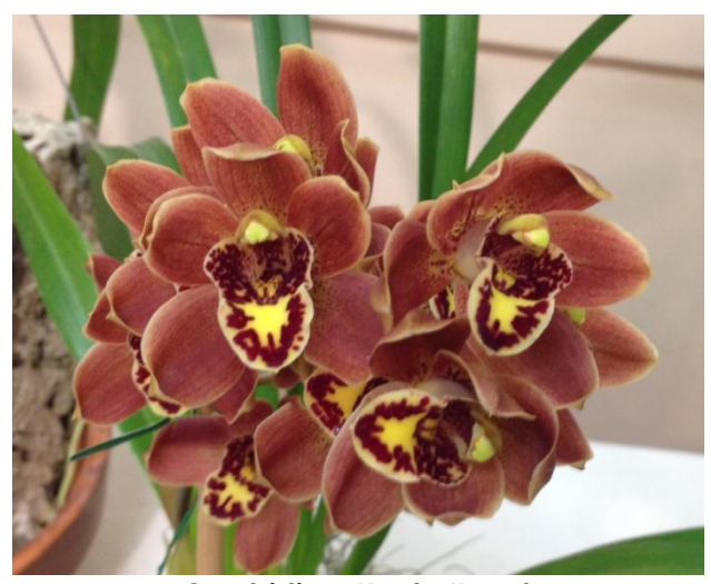
Cymbidium Koala 'Bear' Trudy Hadler