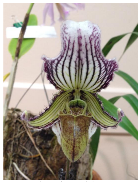
Paphiopedilum fairrieanum