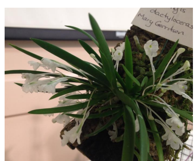
Podangis dactyloceras