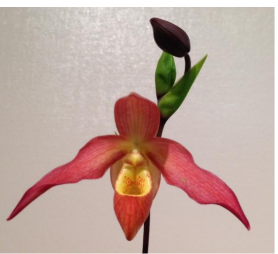
Phragmipedium Chaunie Langland