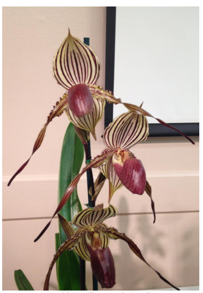
Paphiopedilum Lady Booth Pierre Pujol