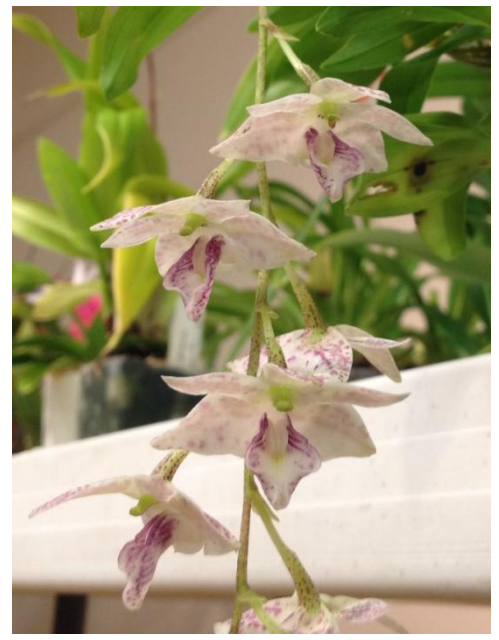
Dendrobium cruttwellii