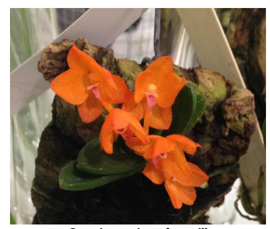
Ceratocentron fesselii