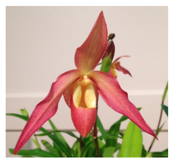
Phragmipedium Chaunie Langland