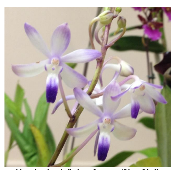
Vandachostylis Lou Sneary 'Blue Bird' Jung Hee Ra