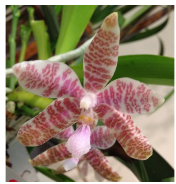
Phalaenopsis hieroglyphica Chaunie Langland