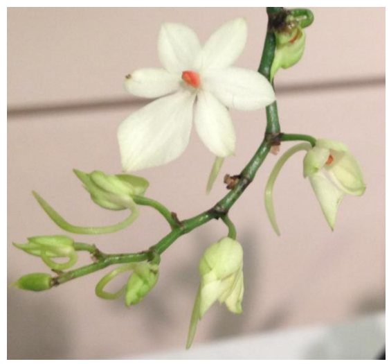
Aerangis luteoalba Rosalie Dedo