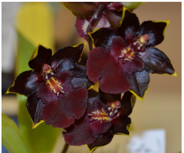
Oncostele Wildcat 'Bobcat' AM/AOS Janusz Warszawski