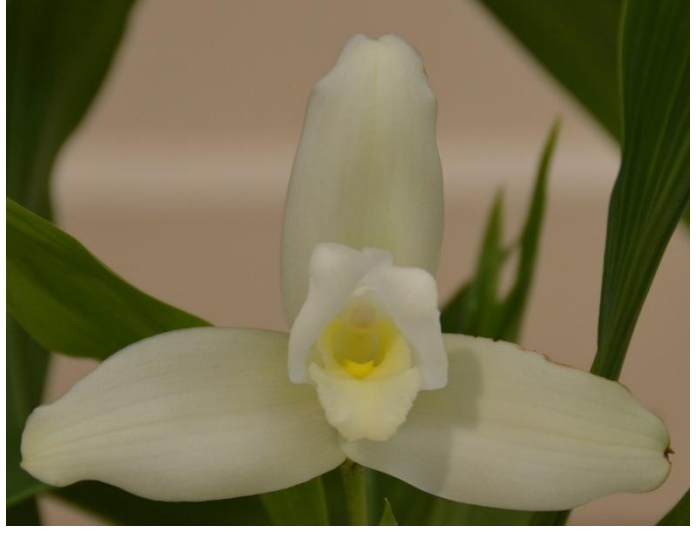
Two different Lycaste Abou First Spring Sharon Langan