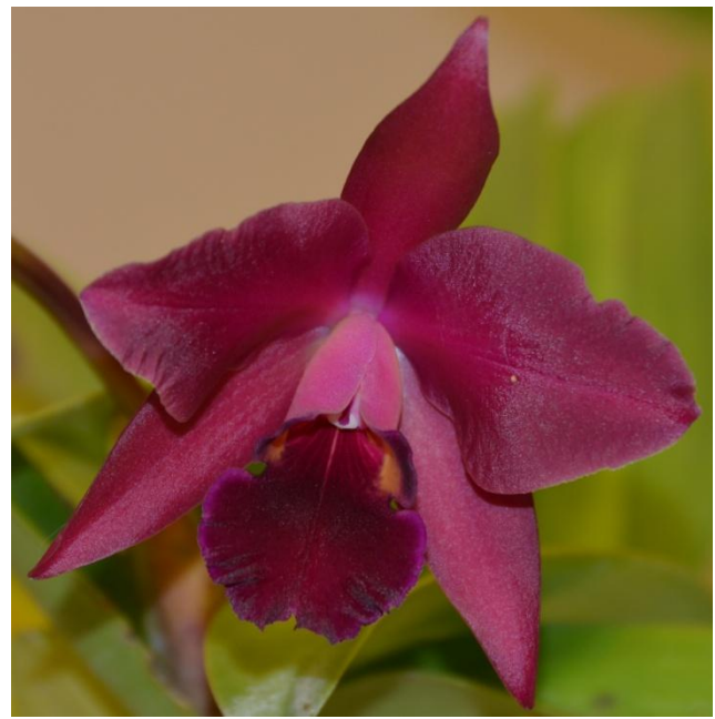
Rhyncattleanthe Cherry Suisse Janusz Warszawski