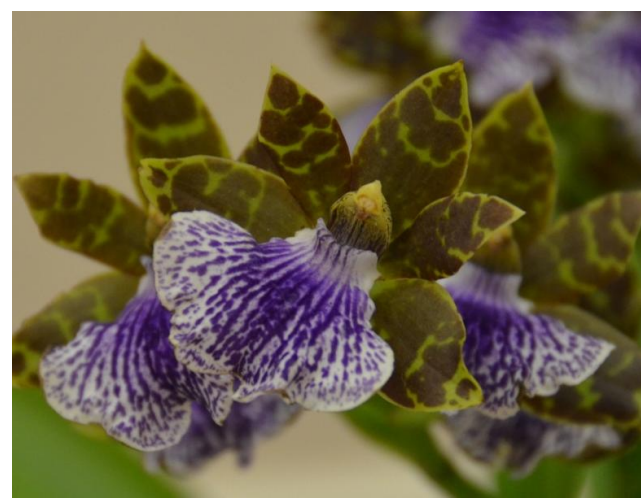
Zygopetalum B.G. White 'Stonehurst' Pierre Pujol