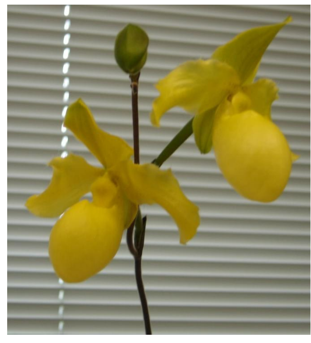
A Paph. Golddollar, a Paph. primulinum based multifloral.

Remember to bring your plants for the show and tell table!