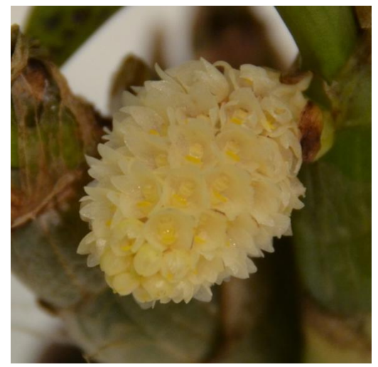
Eria spicata Chaunie Langland