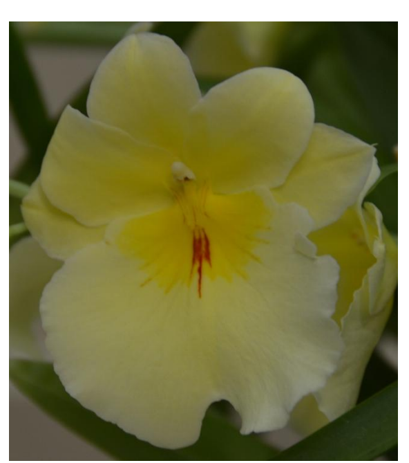
Unknown Miltoniopsis Perre Pujol