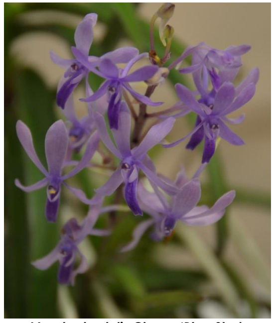
Vandachostylis Charm 'Blue Star' Trudy Hadler