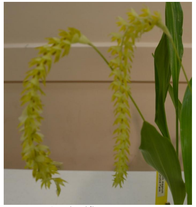
Dendrochilum magnum Paul Simon