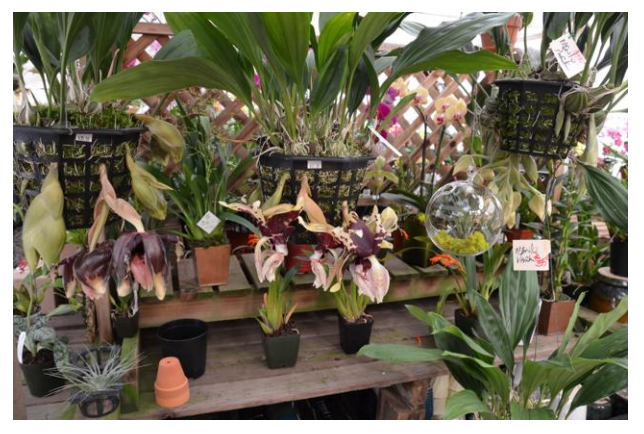
A welcoming display at Brookside Orchids