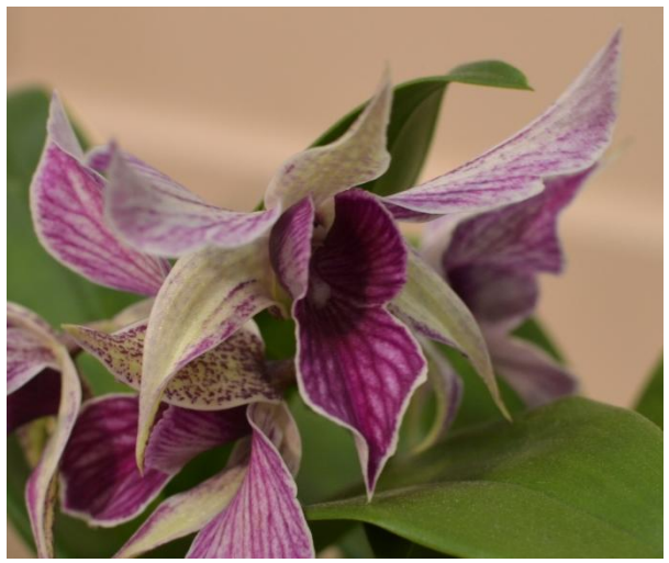
Dendrobium Fire Wings Gloria Bygdnes