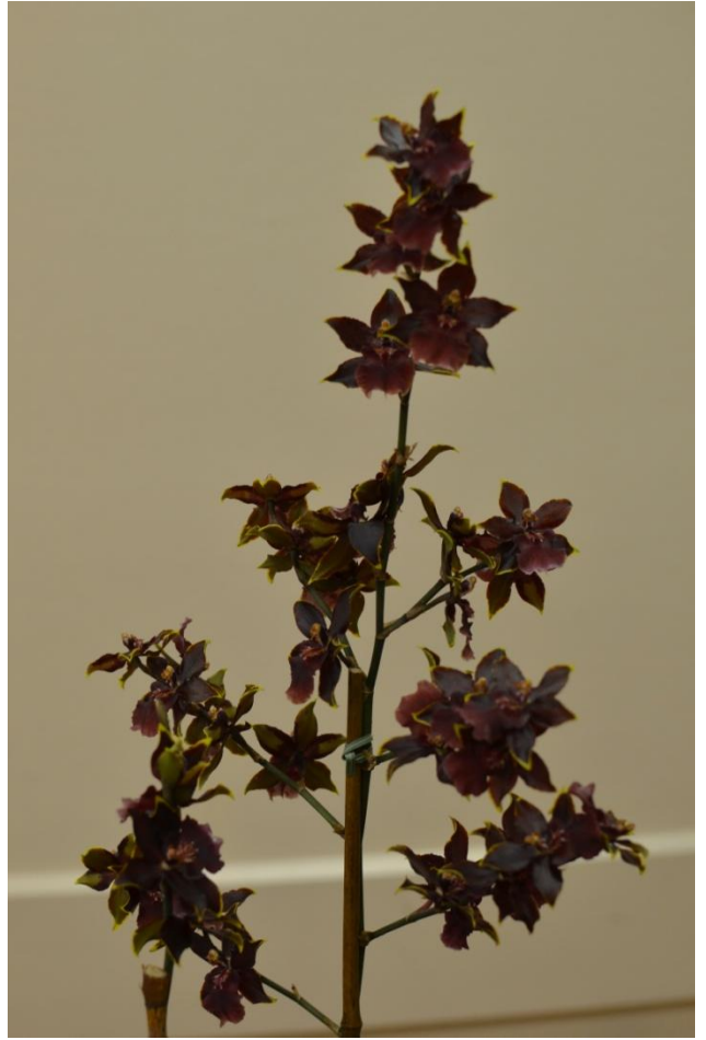
Oncidium Hybrid Jacquet McConville