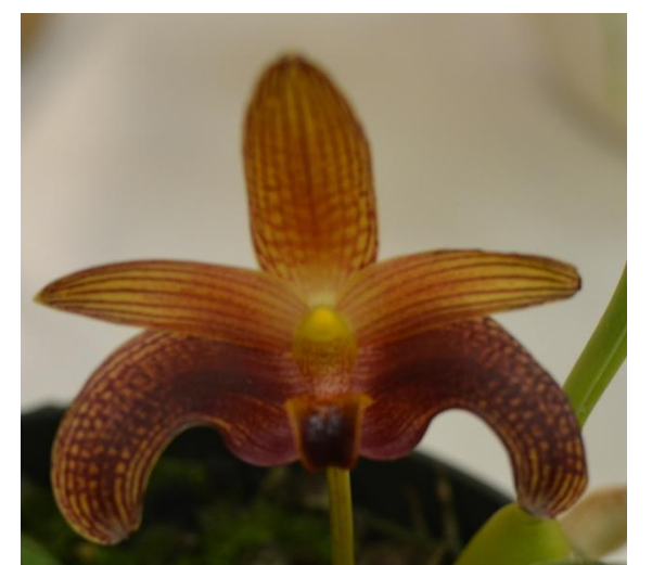
Bulbophyllum sumatranum "A-dorabil" AM/AOS Chaunie Langland