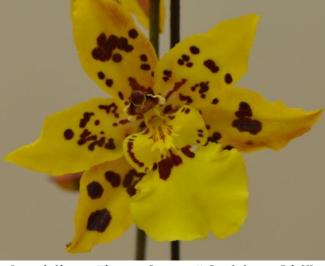
Oncidium Tiger Crow "Golden Girl" Janusz Warszawski