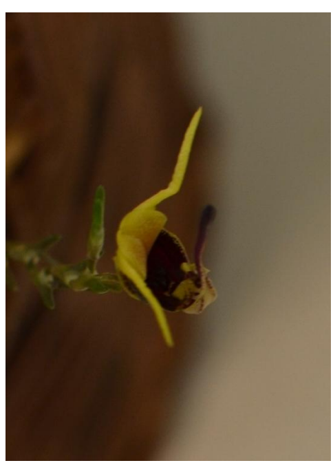
Scaphosepalum breve Terry Boomer