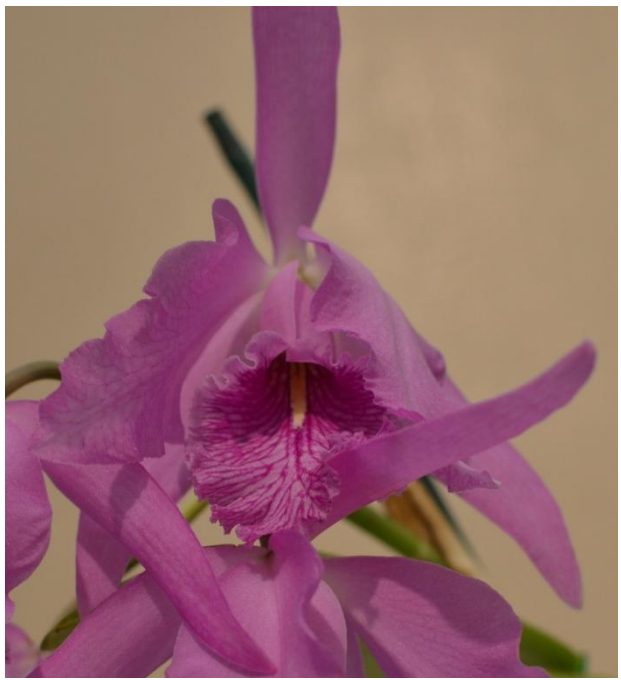
Cattleya maxima "Mrs. Mendel" Chaunie Langland

This was a fantastic presentation! The pot was placed in a little wine glass nestled in purple tissue paper. This elevated the pendant inflorescence and concealed the plastic pot, placing the emphasis on the delicate white flowers.