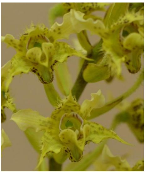
Dendrobium polysema