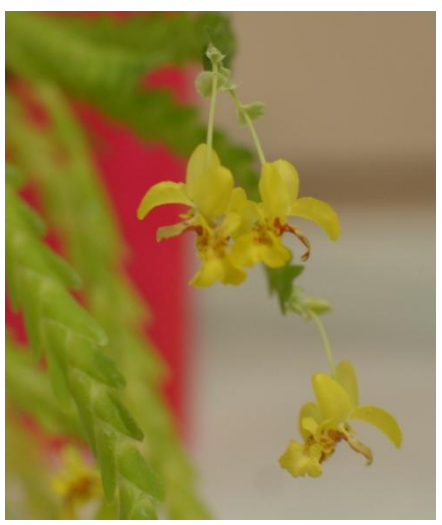
Lockhartia lunifera