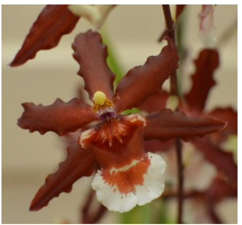
Oncidiium Hybrid Janusz Warszawski