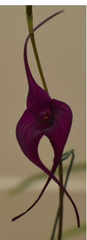
Masdevallia Machu Picchu "Crown Point" Jasen Liu