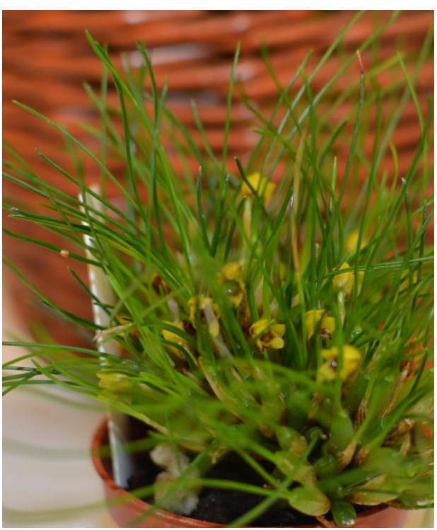
Christensonella vernicosa