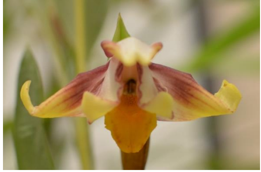
Maxillaria turkeliae