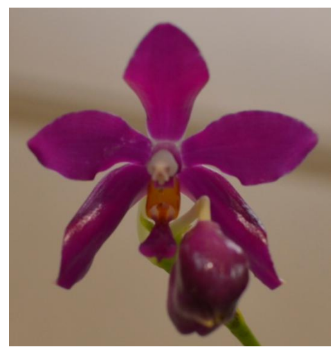
Phalaenopsis pulchra Chaunie Langland