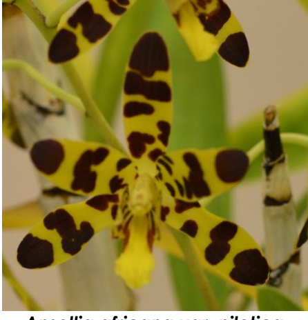
Ansellia africana var. nilotica