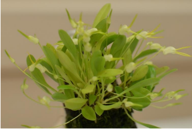
Masdevallia ophioglossa