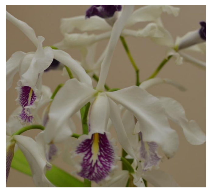
Cattleya maxima semi-alba C. Todd Kennedy