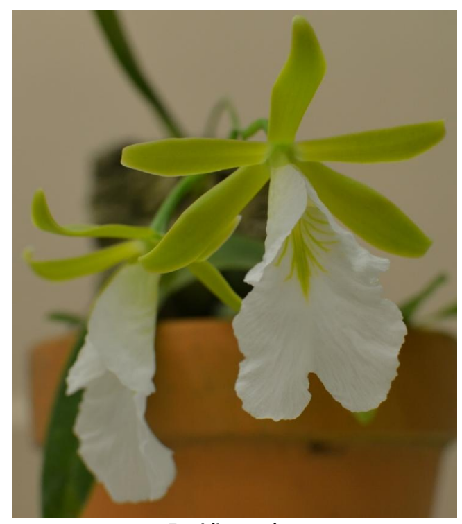
Euchile mariae