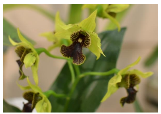
Dendrobium Little Green Apples Anne Riegel