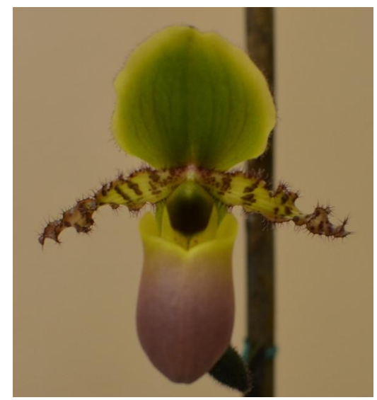
Paphiopedilum Pinnochio Paul Simon