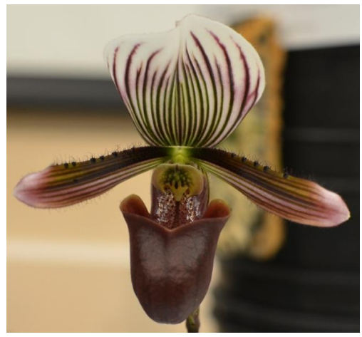
Paphiopedilum barbatum