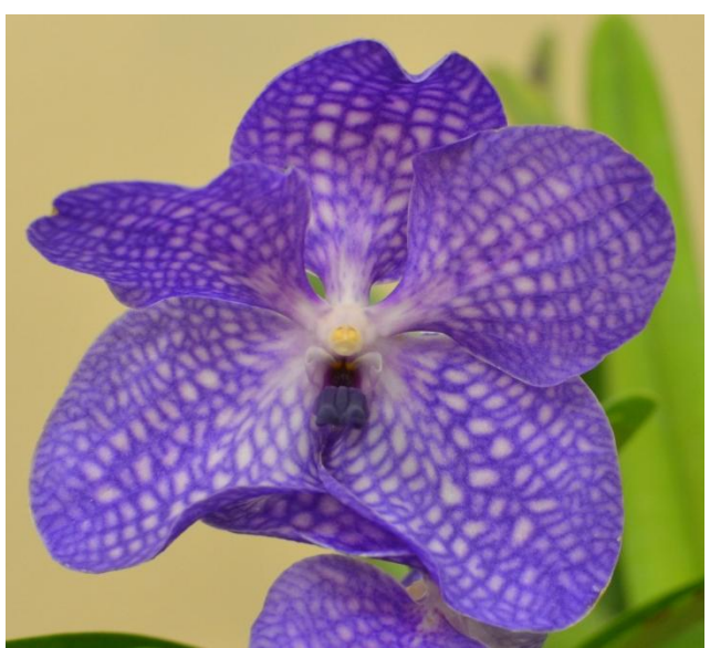
Vanda Sansai Blue