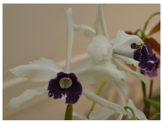
Laelia purpurata roxo-violeta