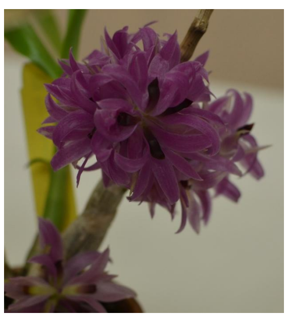
Dendrobium bracteosum var. tannii ('Rosie' x 'Purple Rain') Janusz Warszawski