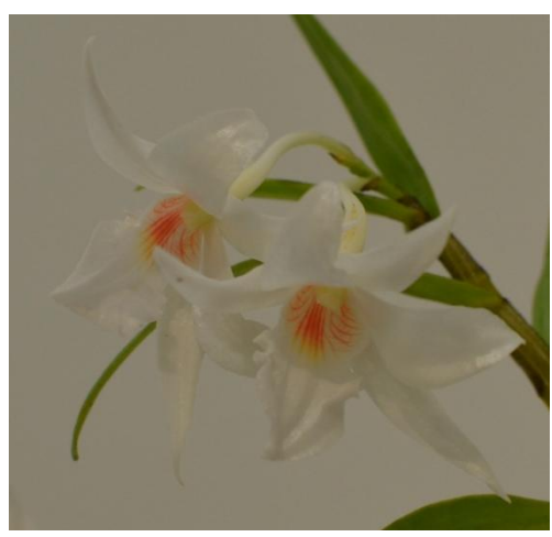
Dendrobium draconis Ginette Sanchou