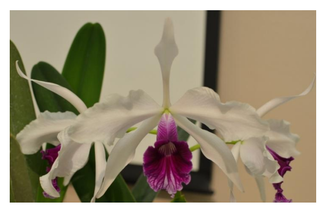
Laelia purpurata Sung Lee