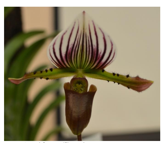
Paphiopedilum lawrenceanum