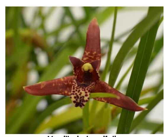
Maxillaria tenuifolia Trudy Hadler