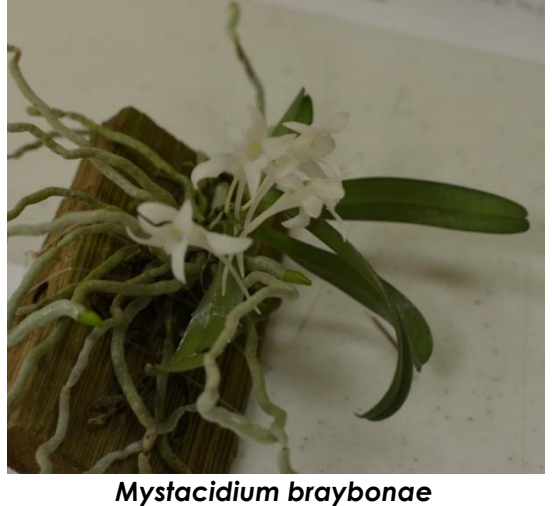
Mystacidium braybonae