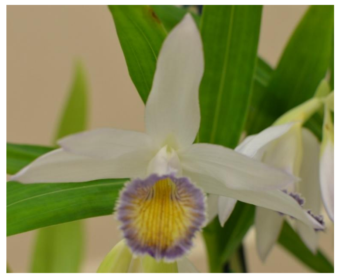
Thunia Gattonensis Chaunie Langland