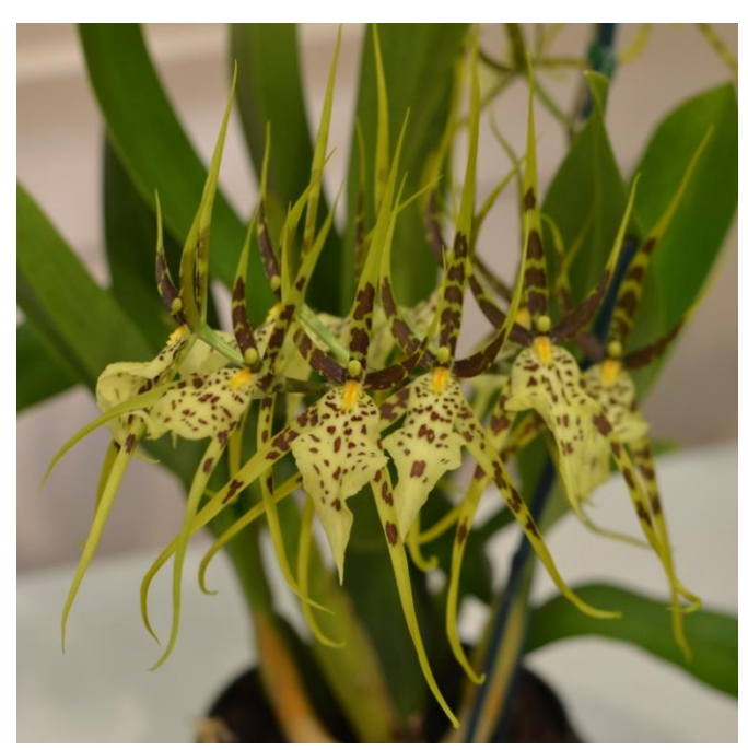
Brassia Eternal Wind Gloria Bygdnes