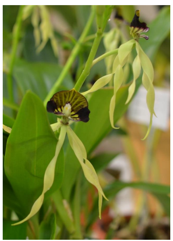
Anacheilium cochleata Anne Riegel