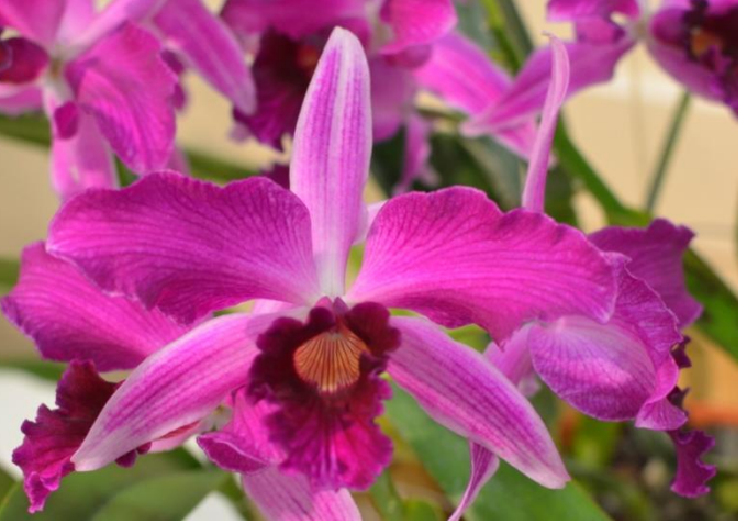
Laelia purpurata sanguinea 'Hot Night' AM/AOS Fred Shull/C. Todd Kennedy