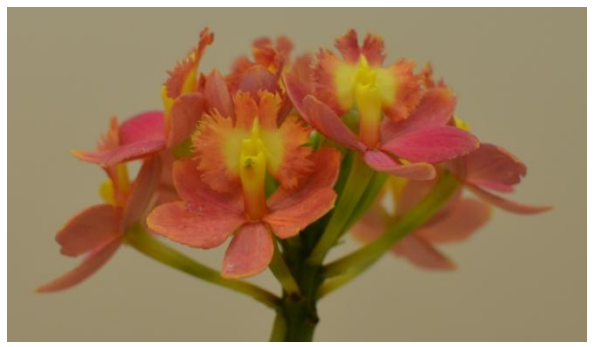
Epidendrum (Pacific Contrast 'Peach Dazzler' x Pacific Sunset 'Lemon Glow') Janusz Warszawski