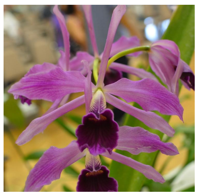
Laelia purpurata sanguinea 'Midnight Sky' x 'Wild Thing' C. Todd Kennedy