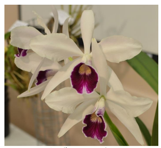
Laelia purpurata Sung Lee