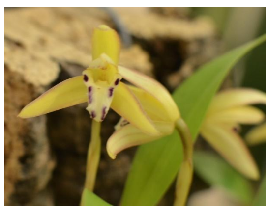
Brasiliorchis gracilis Ginette Sanchou