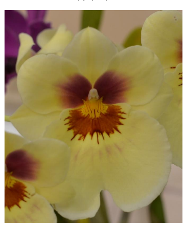
Miltoniopsis Arthur Cobbledick Chaunie Langland