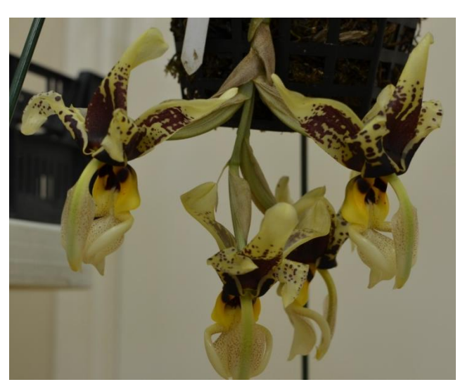
Stanhopea Assidensis