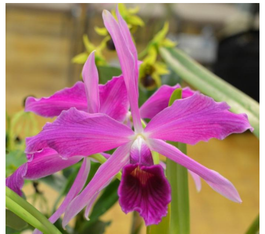
Laelia purpurata sanguinea 'Midnight Sky' HCC/AOS C. Todd Kennedy