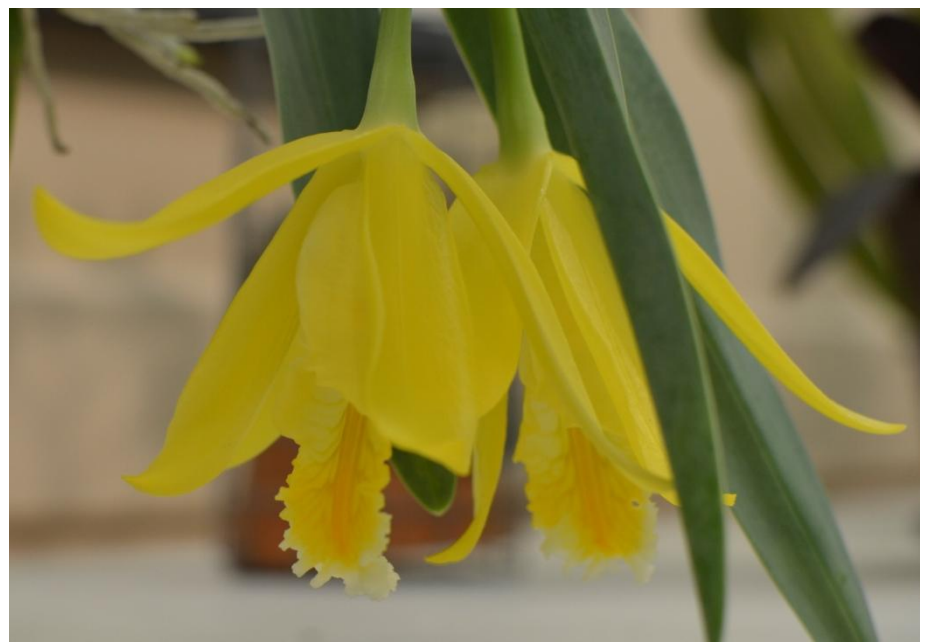
Euchile citrina