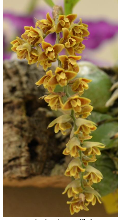
Polystachya affinis