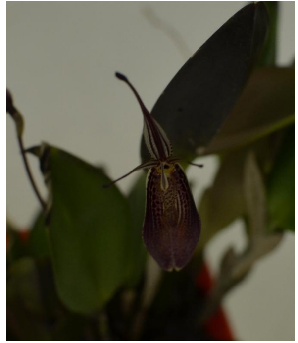
Restrepia contorta