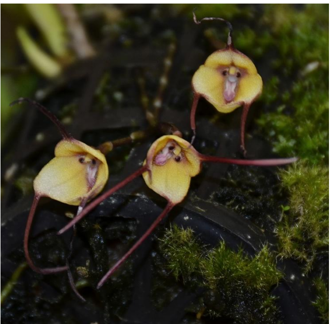
Dracula citrina Chaunie Langland