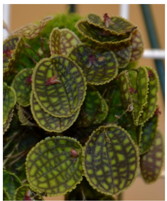
Lepanthes calodictyon