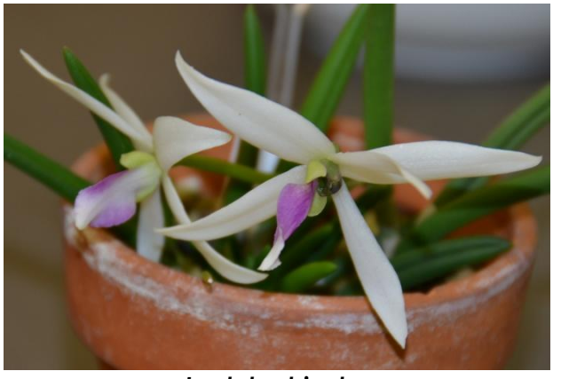
Leptotes bicolor Jung Hee Ra