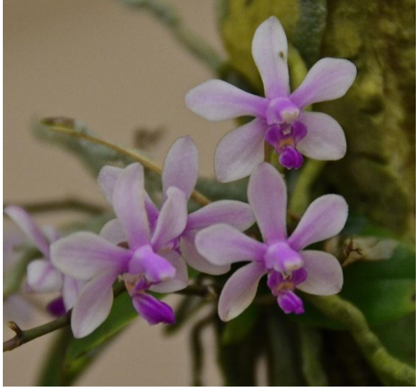
Phalaenopsis honghenensis