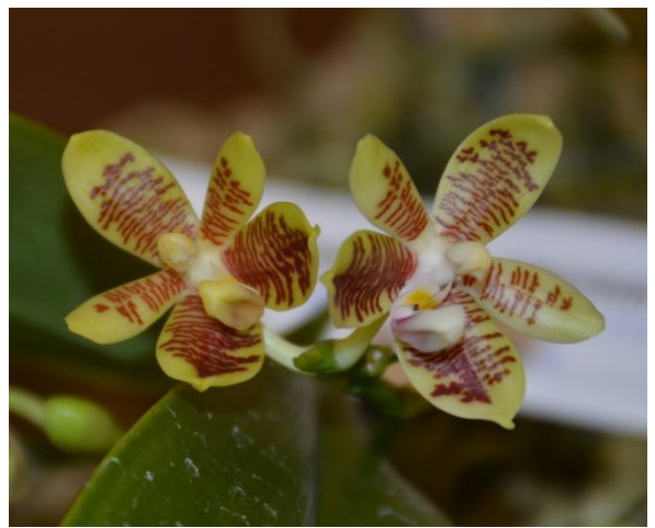
Phalaenopsis inscriptioninensis Tom Mudge