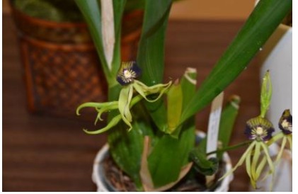
Encyclia cochleata Cat McDonell