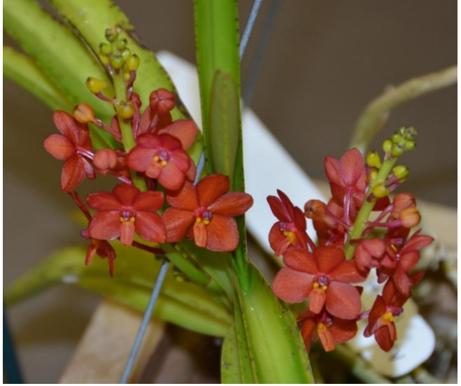
Ascocentrum curvifolium Chaunie Langland