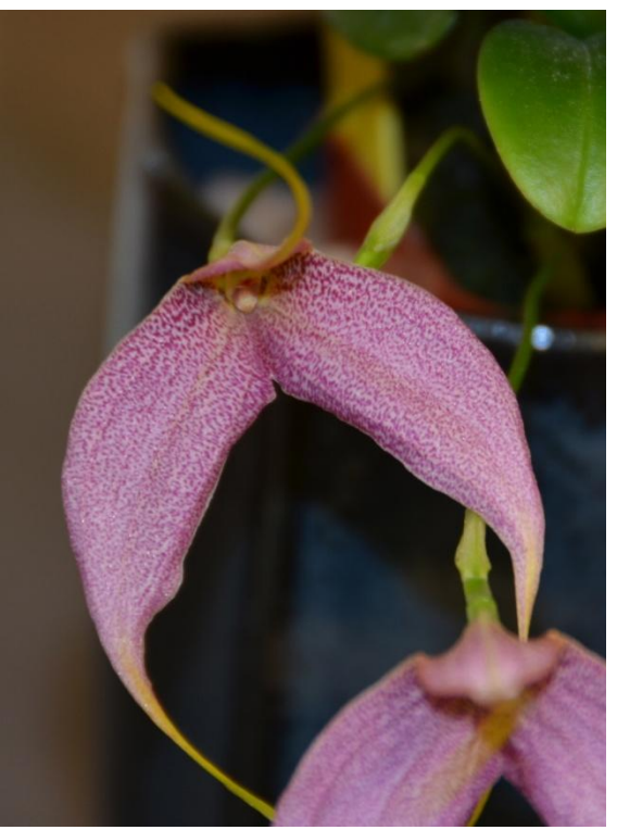
Unknown Masdevallia Unknown grower Beautiful flowers