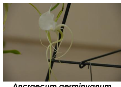
Ancraecum germinyanum Chaunie Langland