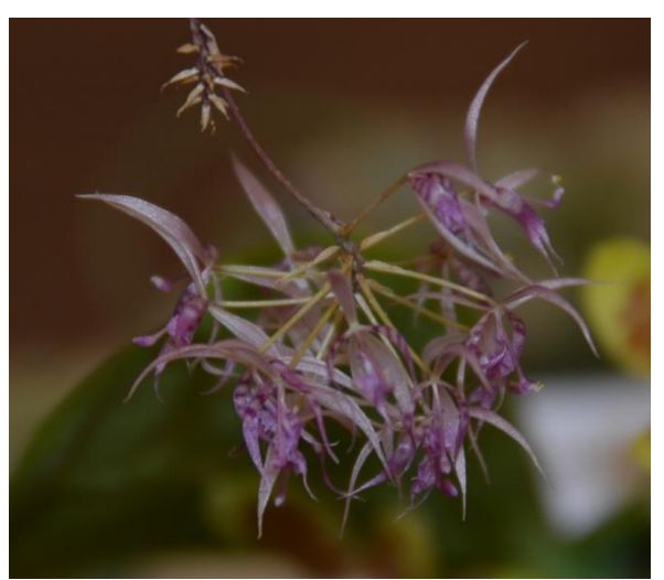
Macroclinium manabinum Tom Mudge