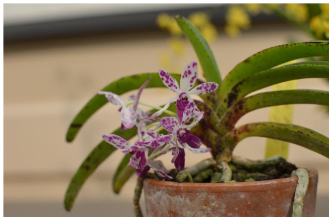
Neostylis Pinkie 'Starry Night' Chaunie Langland