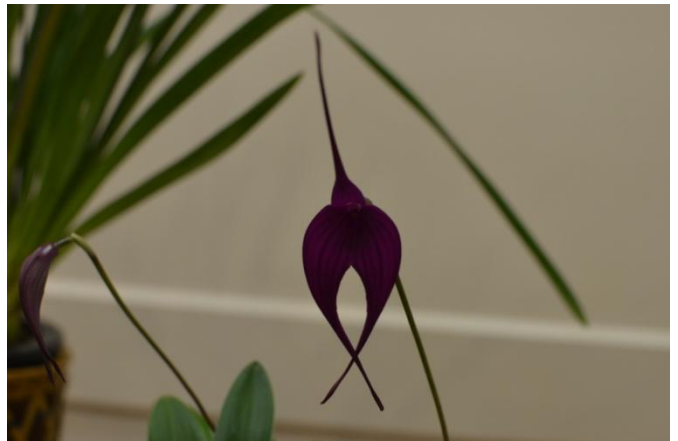
Masdevallia Machu Pichu 'Crownpoint' AM/AOS Jung Hee Ra