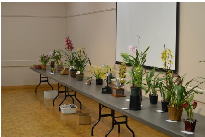
The show table was a little sparse, but the flowers were outstanding!