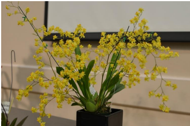
Oncidium Twinkle Chauie Langland