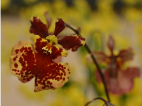
(Tolumnia Elfin Gem 'Kultana' x Oncidium Golden Sunset 'Waiomao') Chauie Langland