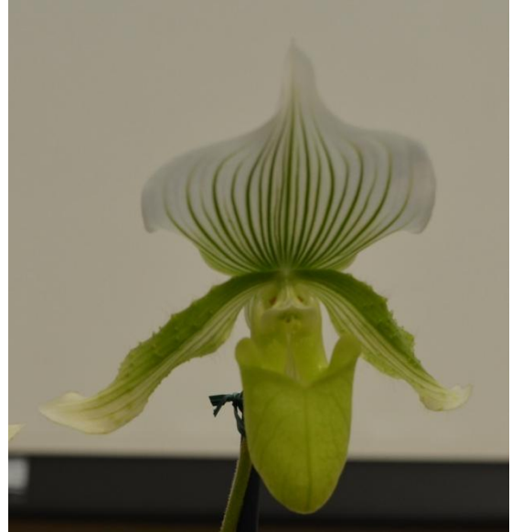
Pahpiopedilum (Hsinying Majakun x Hsinying Citron) Annie Green