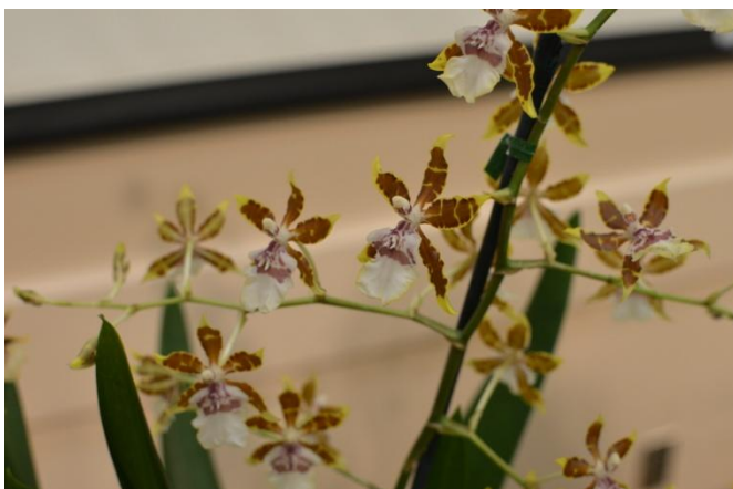
Oncidium Jungle Monarch Gloria Bygdnes