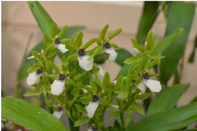
Zygoneria (Adelaide Meadows x Dynamite) Pierre Pujol