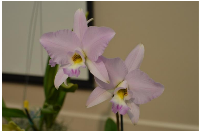
Laelia anceps 'Pink Beauty' HCC/AOS Pierre Pujol