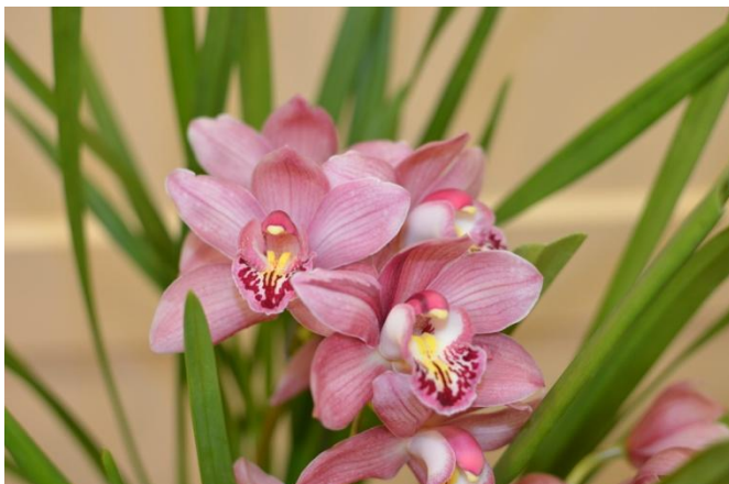
Unknown Cymbidium Janusz Warszawski