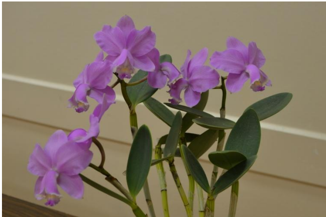
Cattleya loddigesii