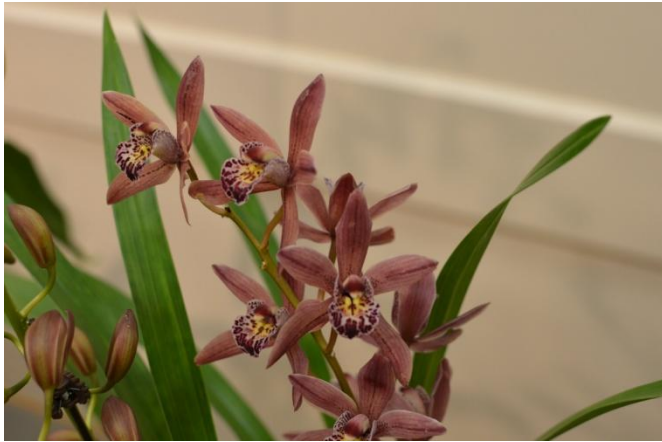
Unknown Cymbidium 'Mimi' Janusz Warszawski