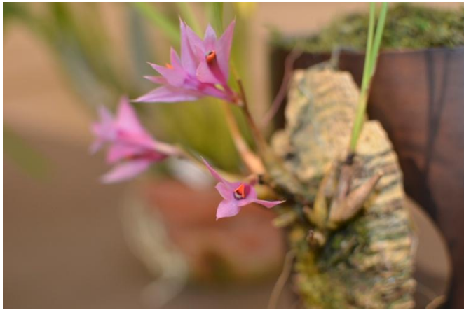
Dendrobium violaceum Ginette Sanchou