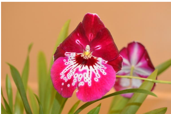
Miltoniopsis Gladys Fumiko Yokoyama Chaunie Langland