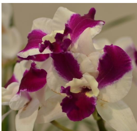
Cattleya Purple Cascade 'Fragrant Beauty' Pierre Pujol