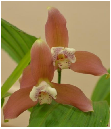
Lycaste hybrid Paul Reeve