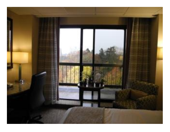
Comfortable rooms with nice views

The 2014 Spring Members Meeting will take place in Minneapolis, Minnesota and will have all the bells and whistles to make it a fun and informative meeting for any orchid enthusiast. They hosted a meeting in 2005 and are very excited about hosting another one. I am looking forward to going!