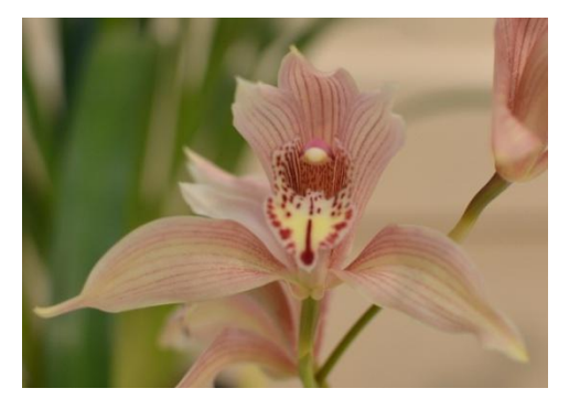
Cymbidium Forster Alcock Pierre Pujol