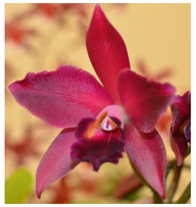
Cattleya hybrid Janusz Warszawski