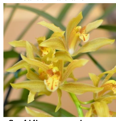
Cymbidium x gammieanum Anna Chai