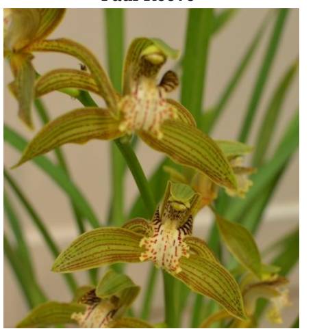
Cymbidium tracyanum