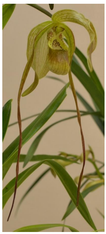
Phragmipedium Giganteum Pierre Pujol