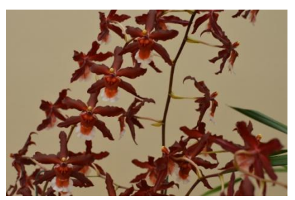
Oncidium hybrid Janusz Warszawski