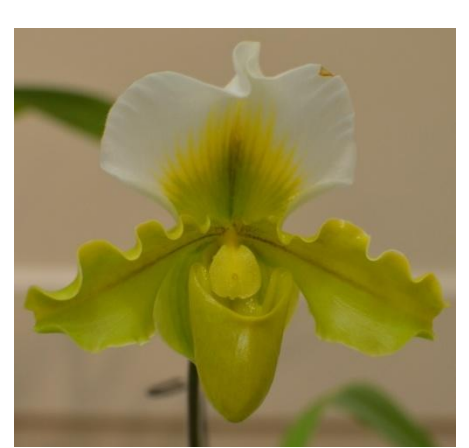
Paphiopedilum Green Mystery Joseph Kautz