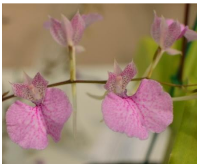
Comparettia macroplectron Chaunie Langland