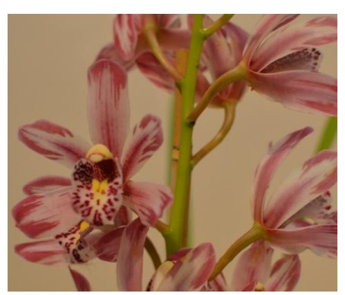
Cymbidium Mainstem 'Hip Hip" Trudy Hadler