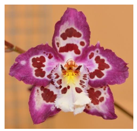
Oncidium Sunset Jaguar