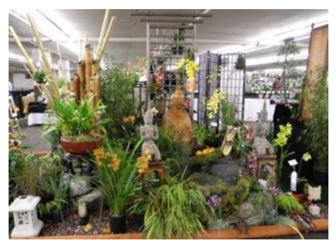
Center show display

The last talk of the day was Alan Koch of Gold Country Orchids. Of course, he talked about Cattleyas! The point that I found most interesting was that the bi-foliates (I think that is the right group - I didn't take notes) grow better and flower better when they have grown out of their pots. You may do better if you grow them on a raft.