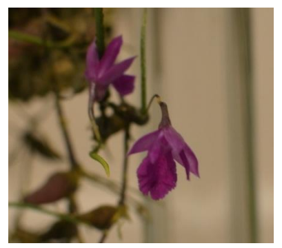
Neolauchea pulchella Chaunie Langland