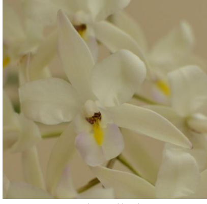
Laelia albida