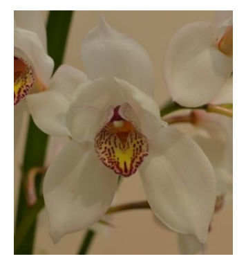
Cymbidium Early Bird 'Pacifica' Pierre Pujol