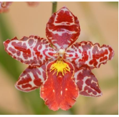
Otoglossum cyrtoglossum 'summit' x 'crystal palace' C. Todd Kennedy