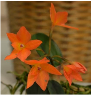
Cattleya cernua Chaunie Langland