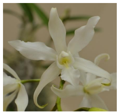
Laelia autumnalis alba Fred Shull