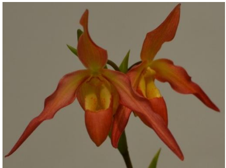
Phragmipedium Albopurpureum x besseae Chaunie Langland