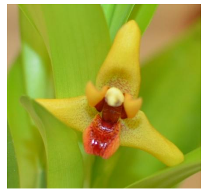
Maxillaria molitor