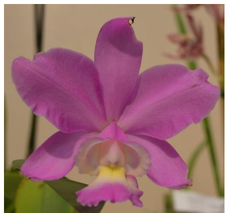
Cattleya Heathii Pierre Pujol