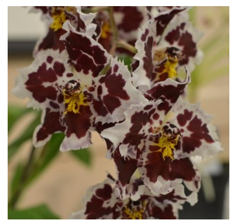
Oncidium Bruce Cobbledick