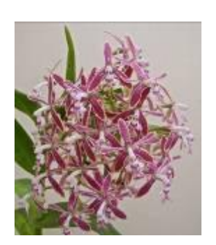
Epi. Pfavi x rariferum