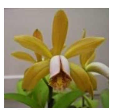
Cattleya forbesii 'Equilab'