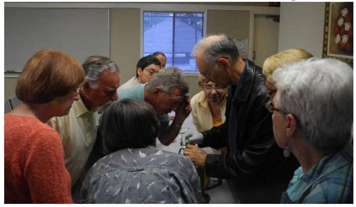
Everyone wanted to get a good look at the process for testing an orchid plant for virus.