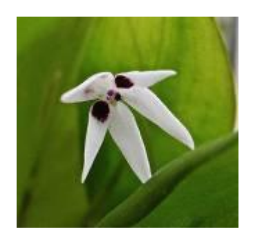
Pleurothallis viduata 'selby'