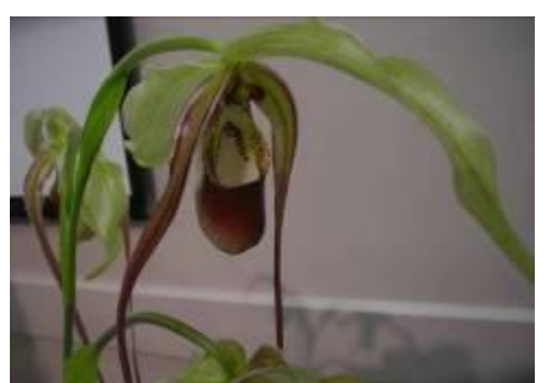
Phrag Devil Fire by Miki White