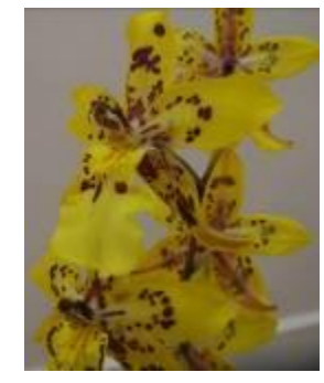
Odontocidium Tiger Crow 'Golden Girl'