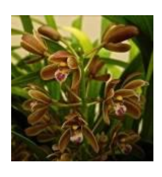
Cymbidium suavissimum