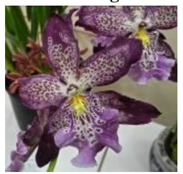
Bllra. Marfitch 'Howard's Dream' AM/AOS