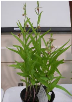
Epipactus gigantea (aka Stream Orchid) Terry Boomer