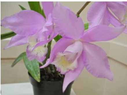
Laeliocattleya Opapeo Fred Shull