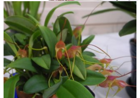
Paphiopedilum Cutie (macabre hybrid) Trudy Hadler