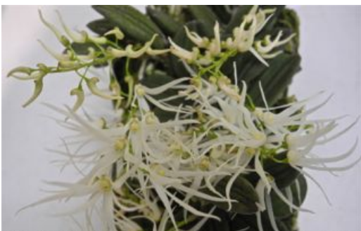
Dendrobium linguiforme