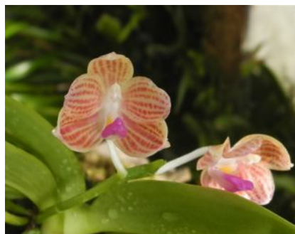
Phalaenopsis javanica Chaunie Langland