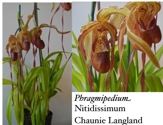
Phragmipedium nitidissimum Chaunie Langland