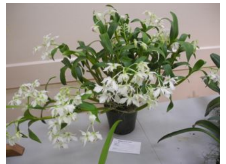
Dendrobium rhodostictum Gerardus Staal