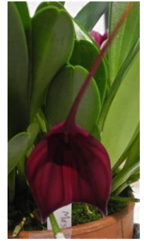
Masdevallia hybrid Mary Gerritsen