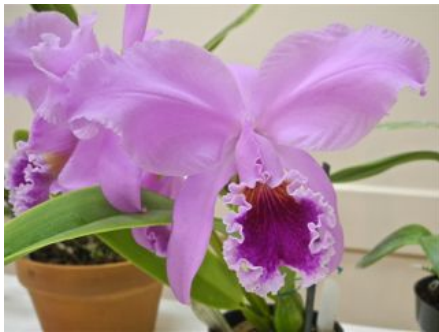
Cattleya mossiae