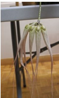
Bulbophyllum longissimum Ginette Sanchou