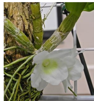
Epidendrum hybrid Janusz Warszawski