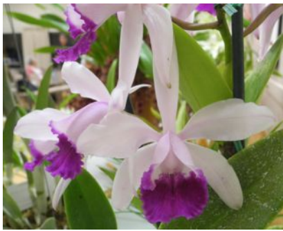
Cattleya intermedia Fred Shull