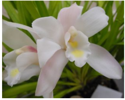
Cymbidium eburneum. 'Coburg' Gloria Bygdnes