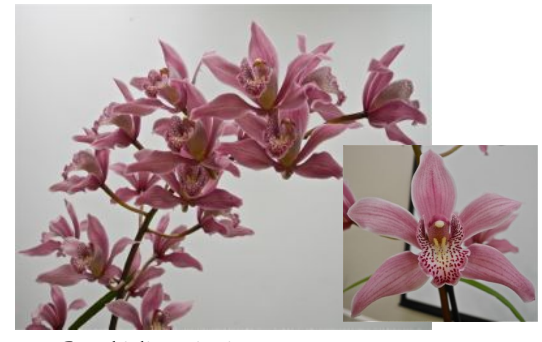
Cymbidium insigne Pierre Pujol