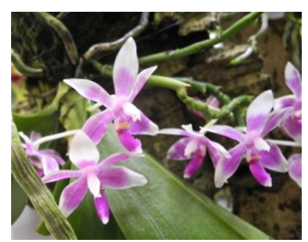
Phalaenopsis modesta Tom Mudge