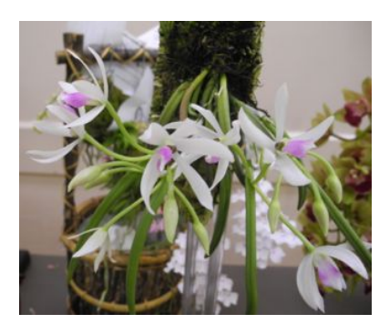
Leptotes bicolor Chaunie Langland