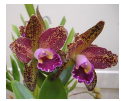
Brassolaeliocattleya Waianae Leopard Pierre Pujol