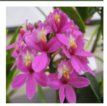
Epidendrum. Rose Valley