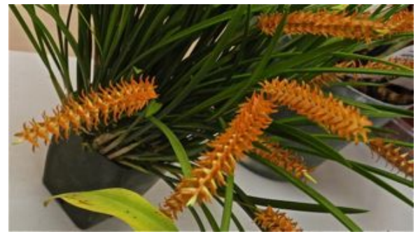
Dendrochilum wenzellii