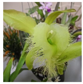
Rhyncholaelia digbyana