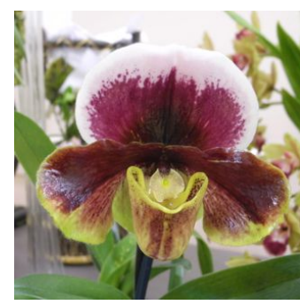
Paphiopedilum. Winston Churchill Pierre Pujol