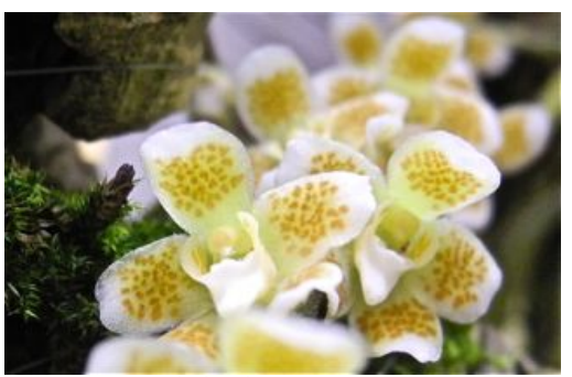
Chiloschista species Tom Mudge