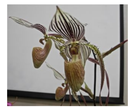
Paphiopedilum. St. Swithin Rosalie Dedo