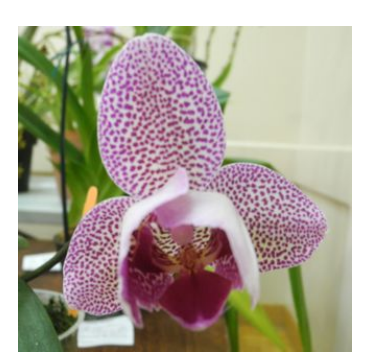
Phalaenopsis no name Pierre Pujol