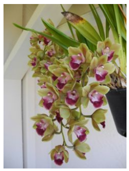
Cymbidium. Pearl Dawson Chaunie Langland