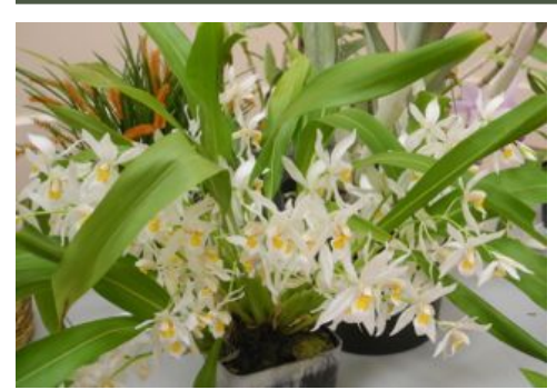
Coelogyne ochracea