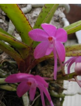
Ascofinetia Cherry Blossom Chaunie Langland