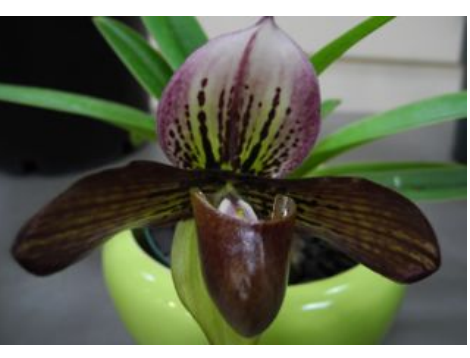
Paphiopedilum_ Charlie Tiger