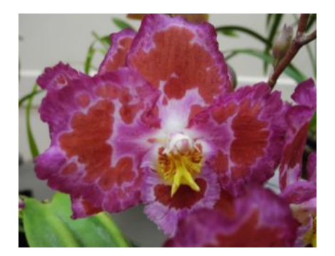
No name Janusz Warszawski