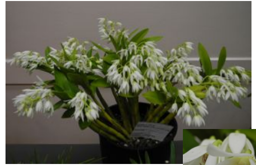
Dendrobium falcorostrum.