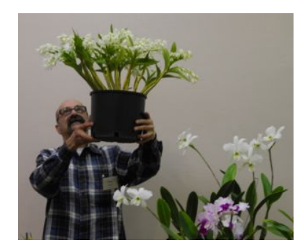
In Level II, the plant is much larger and you don't need quite as much height to achieve excellent results.

Level III is not pictured so as to discourage people from trying this level without adequate supervision. I will just mention that Level III involves a plant grown by Jerry Rodder.