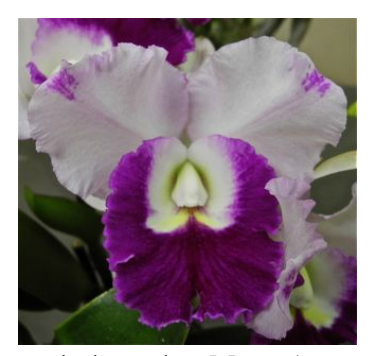
Brassolaeliocattleya Mem. Anna Balmores Pierre Pujol