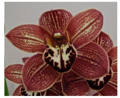
Cymbidium. (tag blocked) Jeff Trimble First bloom