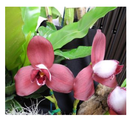
Best Other Genus Best Open Entry Best Other Genus in Show Lycaste Chita Impulse 'Deacon' Cal-Orchid