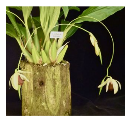
Best Coelogyninae Best Coelogyninae in Show Coelogyne usitana Golden Gate Orchids