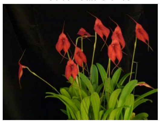
Best Pleurothallid Alliance Best Pleurothallid in Show Barbara T. Kennedy Trophy Masdevallia Billion-Nims 'Golden Gate'