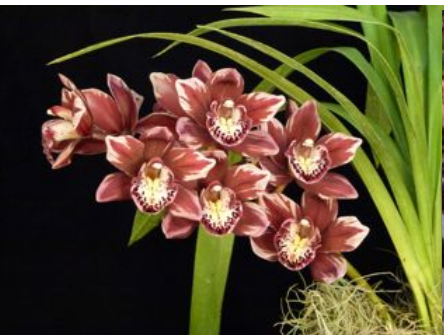
Best Cymbidium Cymbidium Winter Fire 'Splash' Angelic Nguyen/Orchid Design