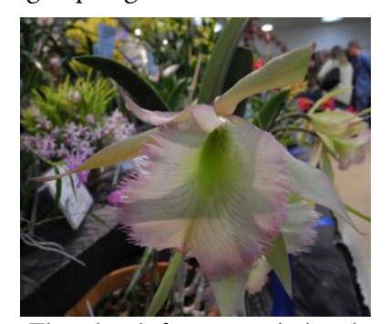
The editor's favorite orchid at the show - Brassavola Jiminy Cricket 'Draw Verde' entered by Fred Shull.