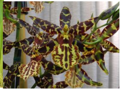
Best Odontoglossum Alliance Best Odontoglossum in Show Maclellanara Leopard 'Golden Gate', AM/AOS Golden Gate Orchids