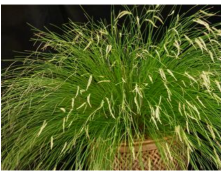
Best Coelogyninae Dendrochilum tenellum Sue Rose