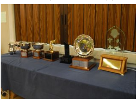
POS Perpetual Trophies