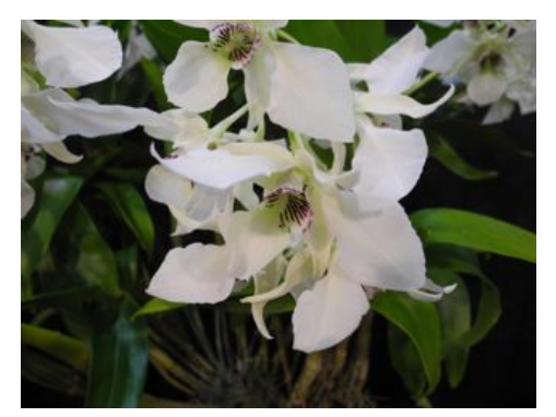
Best Dendrobium Best Dendrobium in Show Dendrobium Roy Tokunaga Napa Valley Orchids