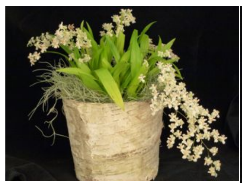
Best Odontoglossum Alliance Oncidium Twinkle Ginger Creevy