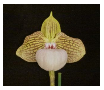
Best Paphiopedilum Alliance Paphiopedilum Fanaticum Sue Rose