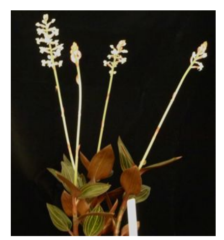
Best Foliage Ludisia discolor Joseph Kautz