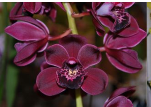
CSA Silver Medal Winner Cymbidium Ruby Turner (Black Forest x Ruby Eyes)