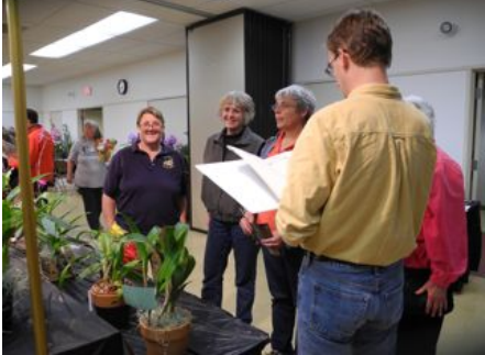
Cymbidium Society of America (CSA) judging took place Friday night concurrent with the show ribbon judging. Left: CSA selects plants to judge. Middle: CSA Scoring. Right: One of the ribbon judging teams.