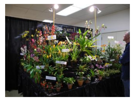
Golden Gate Orchids had an attractive and active booth as usual