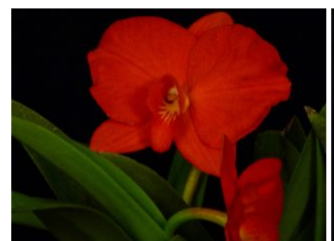
Best Cattleya Alliance Sophronitis coccinea Golden Gate Orchids