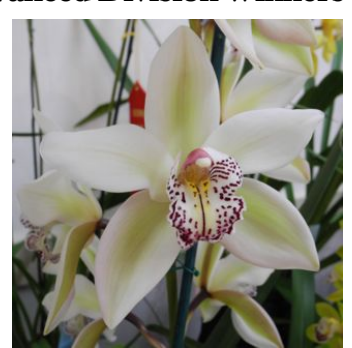
Best Cymbidium Best Cymbidium in Show Cymbidium Peter Dawson 'Grenadier' Weegie Caughlan