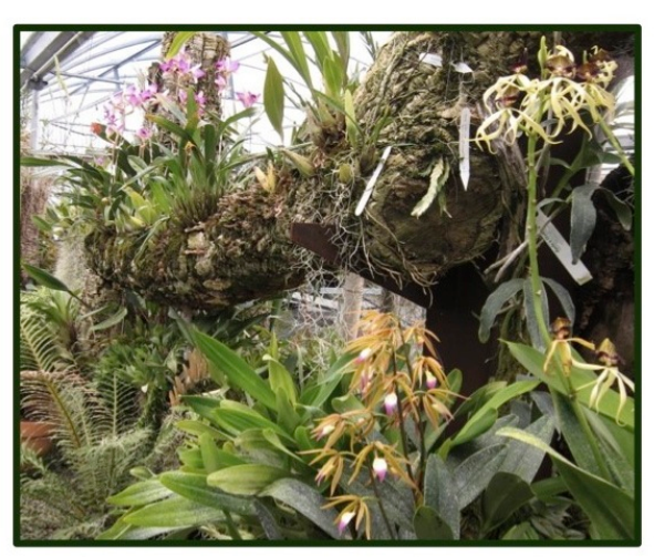
Our outdoor orchid logs in full bloom, Jan. 2012