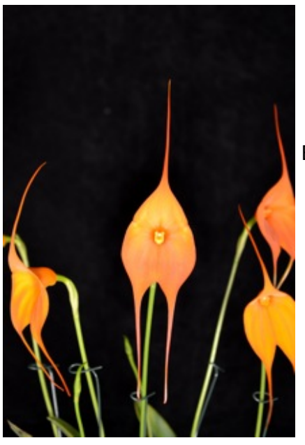
Masdevallia Highland Monarch 'Golden Gate' AM 80

(Masd. Highland Fling x Monarch) Exhibited by Golden Gate Orchids