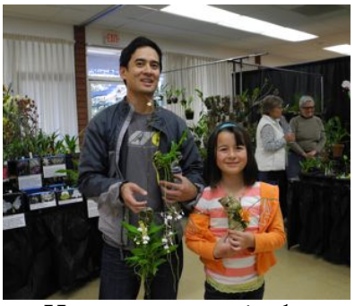
Happy customers in the sales area!