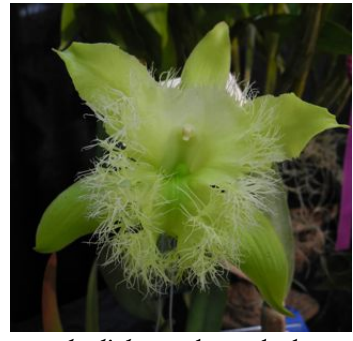
Brassavola digbyana, brought by Napa Valley Orchids, is a parent of Brassavola Jiminy Cricket. The other parent is nodosa