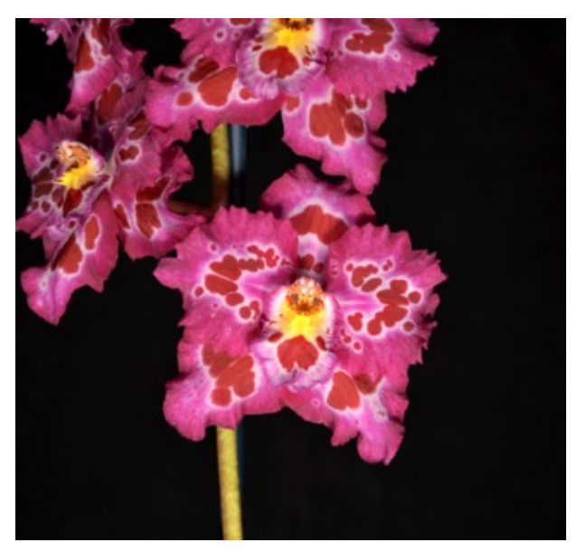
Lycaste Chita Impulse 'Deacon' HCC 79

(Oda. Saint Clement x Aviewood) Exhibited by Golden Gate Orchids