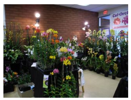
Cal-Orchids had some great things for sale