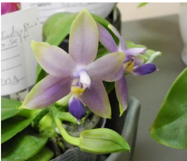
Phalaenopsis violacea 'Indigo Blue ' Cordelia Wong