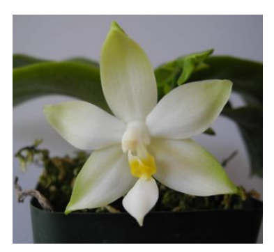
Phalaenopsis violacea var. alba Chaunie Langland