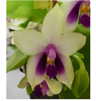
Phalaenopsis bellina var. coerulea Cordelia Wong