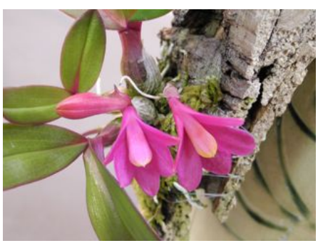
Dendrobium laevifolium.