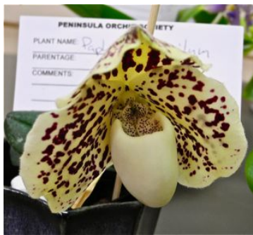
Paphiopedilum leucochilum. Fred Cox