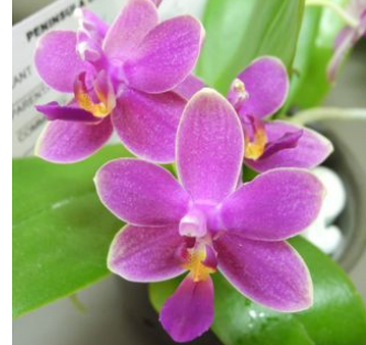
Phalaenopsis Lioulin Sweet 'Sweetheart' Cordelia Wong