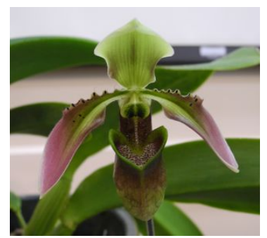
Paphiopedilum hainanense.