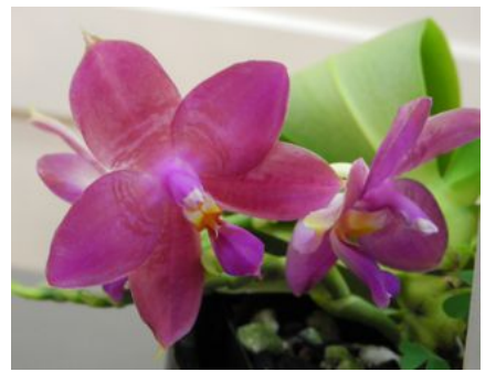
Phalaenopsis Hannover Passion xTabasco Tex Cordelia Wong