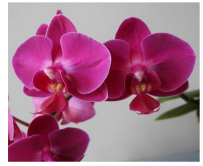
Phalaenopsis Sweet Strawberry Chaunie Langland