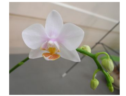
Phalaenopsis Cassandra x DoritaenopsisTaihort CoralJackie Becker