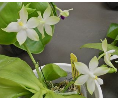
Phalaenopsis bellina var. alba Fred Cox