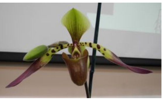
Paphiopedilum lowii Joseph Kautz