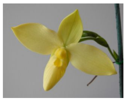
Phragmipedium besseae var. flavum. Chaunie Langland