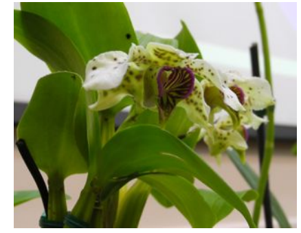
Dendrobium atroviolaceum.