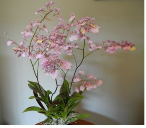
Ionocidium . Popcorn put on a large flower display from a 2 1/2" pot.