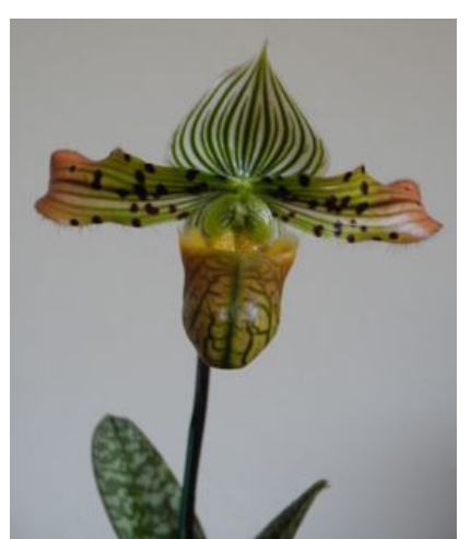
Paphiopedilum venustum is a 2009 op. table plant from White Oak Orchids Chaunie Langland