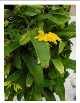
Bulbophyllum sulphureum. Pat & Zach Coney