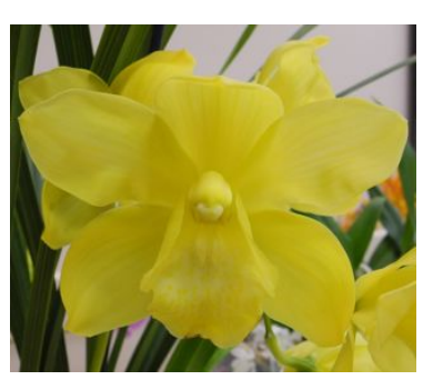
Cymbidium. Dawn Beauty first bloom Jeff Trimble