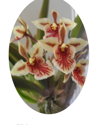
Tolumnia triquetra Chaunie Langland