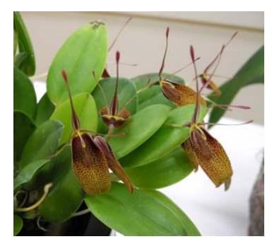
Restrepia species Pat & Zach Coney