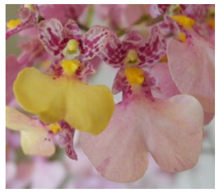
Ionocidium. Popcorn is an example of flowers that are yellow when first open, turning to pink.