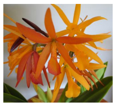
Bc. Bill Worsely x Sl. Psycho Chaunie Langland