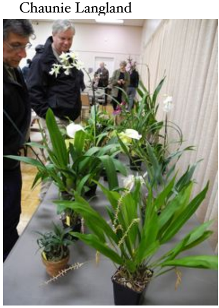
The fabulous opportunity table was supplied by White Oak Orchids