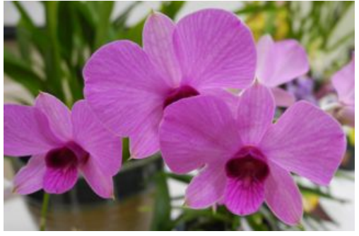
Dendrobium no name