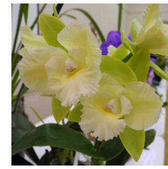
Epicattleya Siam Jade 'Avo' Janusz Warszawski