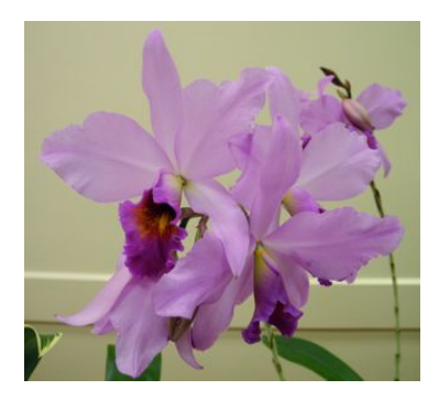
Laeliocattleya Caligula Fred Shull