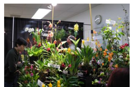
Golden Gate Orchids had an attractive and active booth as usual