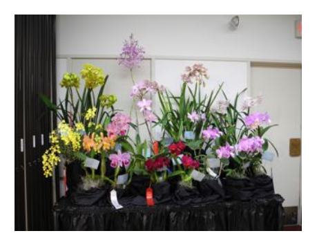
Amy and Ken Jacobsen built a beautiful display of their orchids