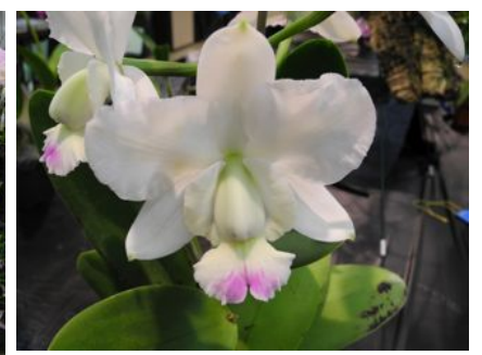
Cattleya walkeriana 'Kenny'