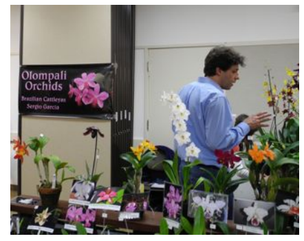
New vendor Olompali Orchids sales booth