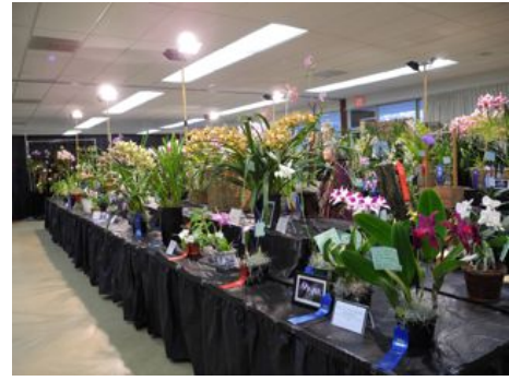
Table 1 of individual competitors plants in the show room.