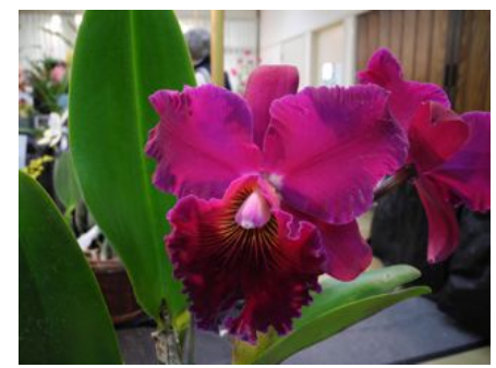
Brassolaeliocattleya Lawless Walkiire 'The Ultimate' Pierre Pujol