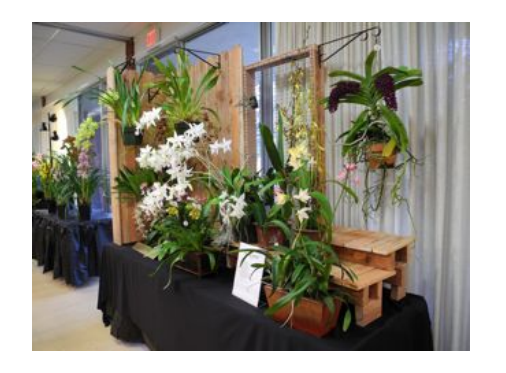
Brookside Gardens Show Display