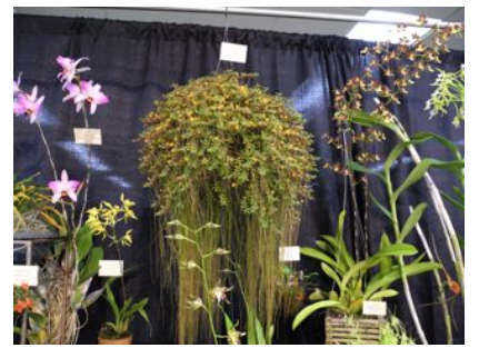
Hanging Gardens Show Display