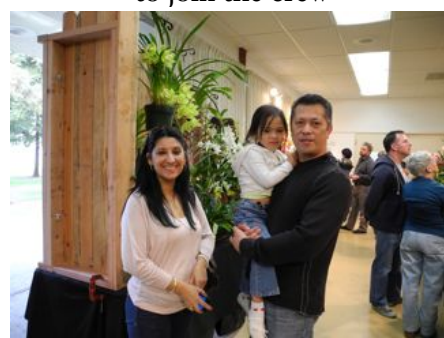
Some start young