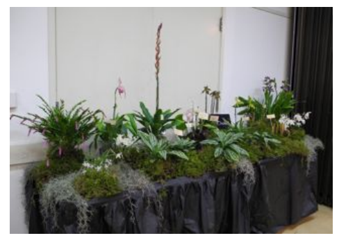
Cal-Orchids Show Display