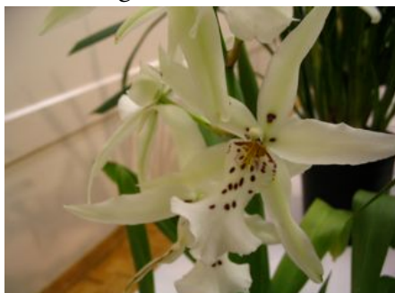
Dgmra. Winter Wonderland The Staals