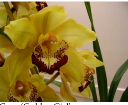
Cym. 'Golden Girl' Heather Deobus