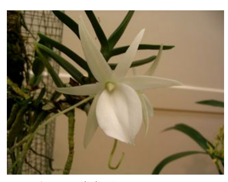
Angcm. didieri