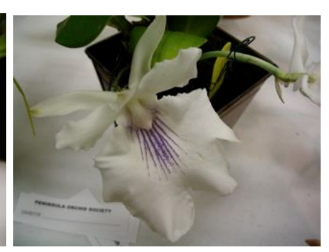
Cnths. amazonica Chaunie Langland