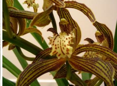
Cym. tracyanum. 'Sam's'