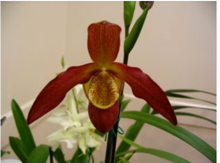
Phrag. Noirmont The Boomers