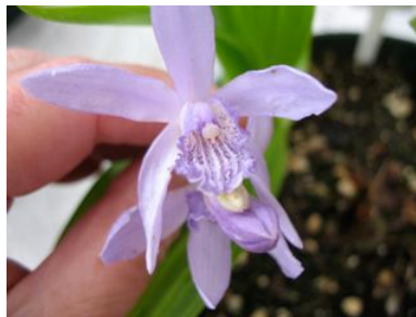
Bletilla striata 'Murasaki Shikibu' and Zygostates alleniana