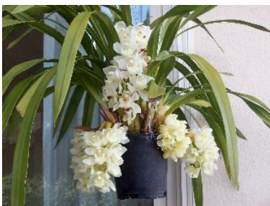
Cym. unknown