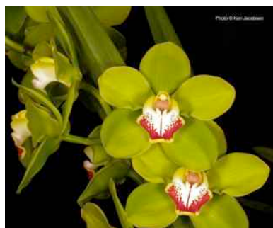
Cym. unreg. hybrid 'Cinnabar' HCC 76 Weegie Caughlan