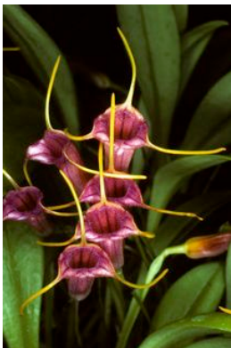
Masd. mystica and Epactis gigantea