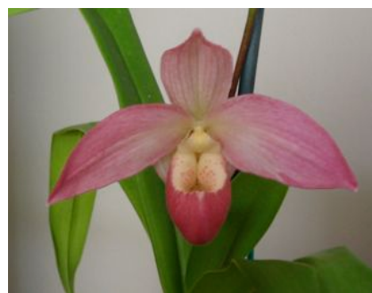
Phrag Cape Sunset (Eric Young x schlimii)

There are many other phragmipedium species, each with its own charms, but besseae seems like the crown jewel to me. Of course, if I could make a hybrid with the petal length of warscewiczianum (around 2 - 3 ft.) and the colors of besseae I would be pretty darn happy.