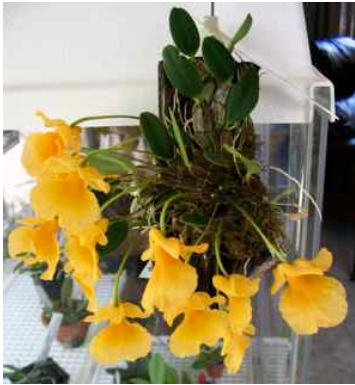
Dend. jenkinsii and BC Busybee "Crothers"