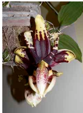
Stan. tigrena 'Predator' and Miltoniopsis spectabilis var. moreliana 'Royalty'