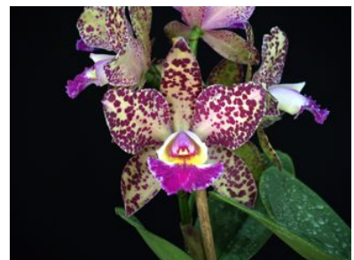
BLC Durigan 'Aquarius', L. purpurata var. semialba 'Genesis', and BLC. Durigan 'Scorpius'