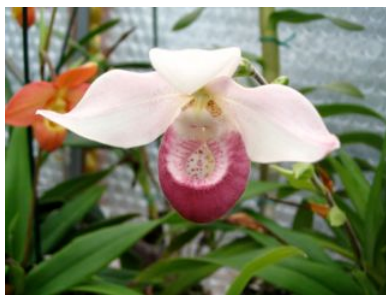
Phrag. Cardinale (sedenii x schlimii)