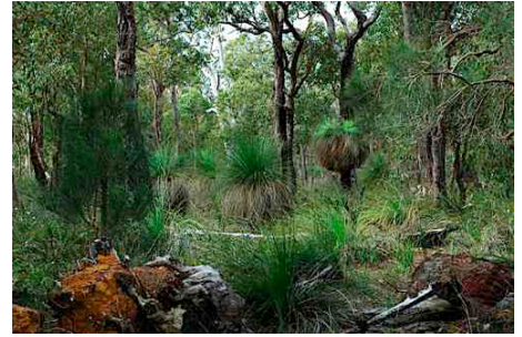
Typical Western Austrailian Bush